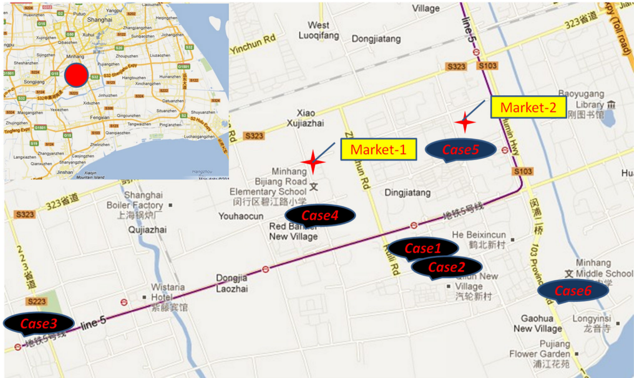
Figure 1. A map of patient residences and the 2 neighboring markets where H7N9 was detected in poultry.