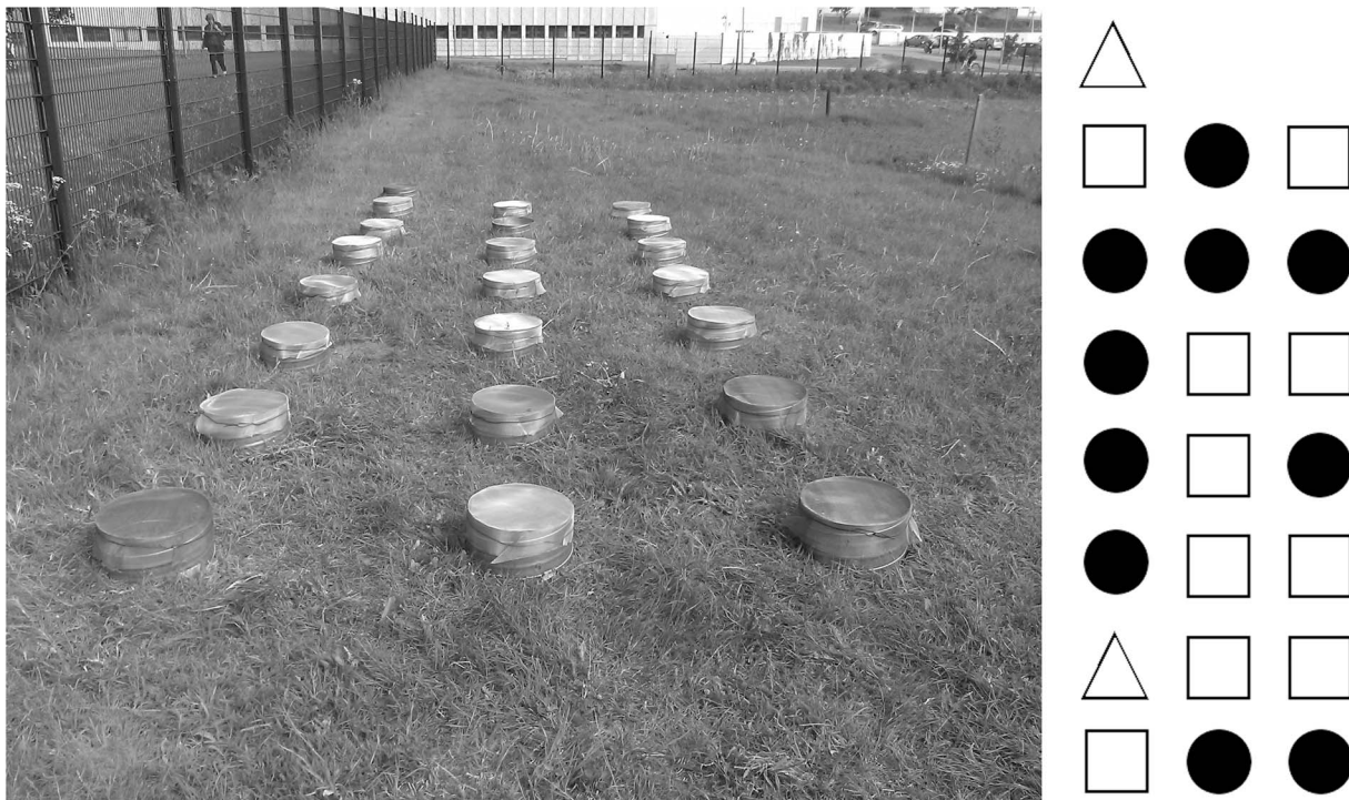
Figure 1. Experimental design used in measuring gas fluxes. (A) Twenty-two mesocosms were placed in an agricultural field, separated by distances of 70 cm. (B) These mesocosms were randomly assigned to three different treatments: 1) dung with dung beetles (open squares; n = 10 ); 2) dung without dung beetles (filled circles; n = 10 ), and 3) chambers containing neither dung nor beetles (open triangles; n = 2 ). doi:10.1371/journal.pone.0071454.g001

cumulative effect of dung beetles on net releases of GHGs from dung pats exposed under semi-natural conditions over the main growing season (June–July) of the boreal zone. Overall, we describe a clear-cut signature of dung beetles on local GHG fluxes under the present experimental conditions, thus offering a seminal suggestion that dung beetles may exert a wider impact on GHG fluxes from agriculture.