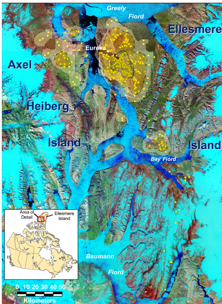
Figure 1. Ellesmere Island, Nunavut, Canada and vicinity with 554 locations of a pack of \geq 20 wolves. This pack was monitored by a global-positioning system radio collar 9 July 2009 through 12 April 2010. The dotted line is the 99% probability contour, the dashed line is the 95% contour, and the solid line, the 60% probability. doi:10.1371/journal.pone.0025328.g001

The GPS collar recorded the collared wolf's locations at 6:00 a.m. and 6:00 p.m. daily from 9 July 2009 through 12 April 2010,