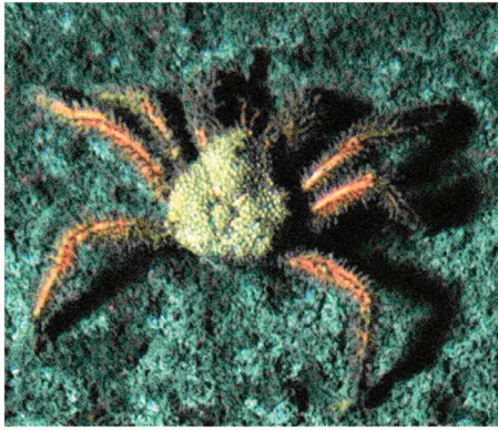
Figure 2. A second type of lithodid crab that we observed rarely at Md. 12 (tentatively identified as Paralomis papillata relative).