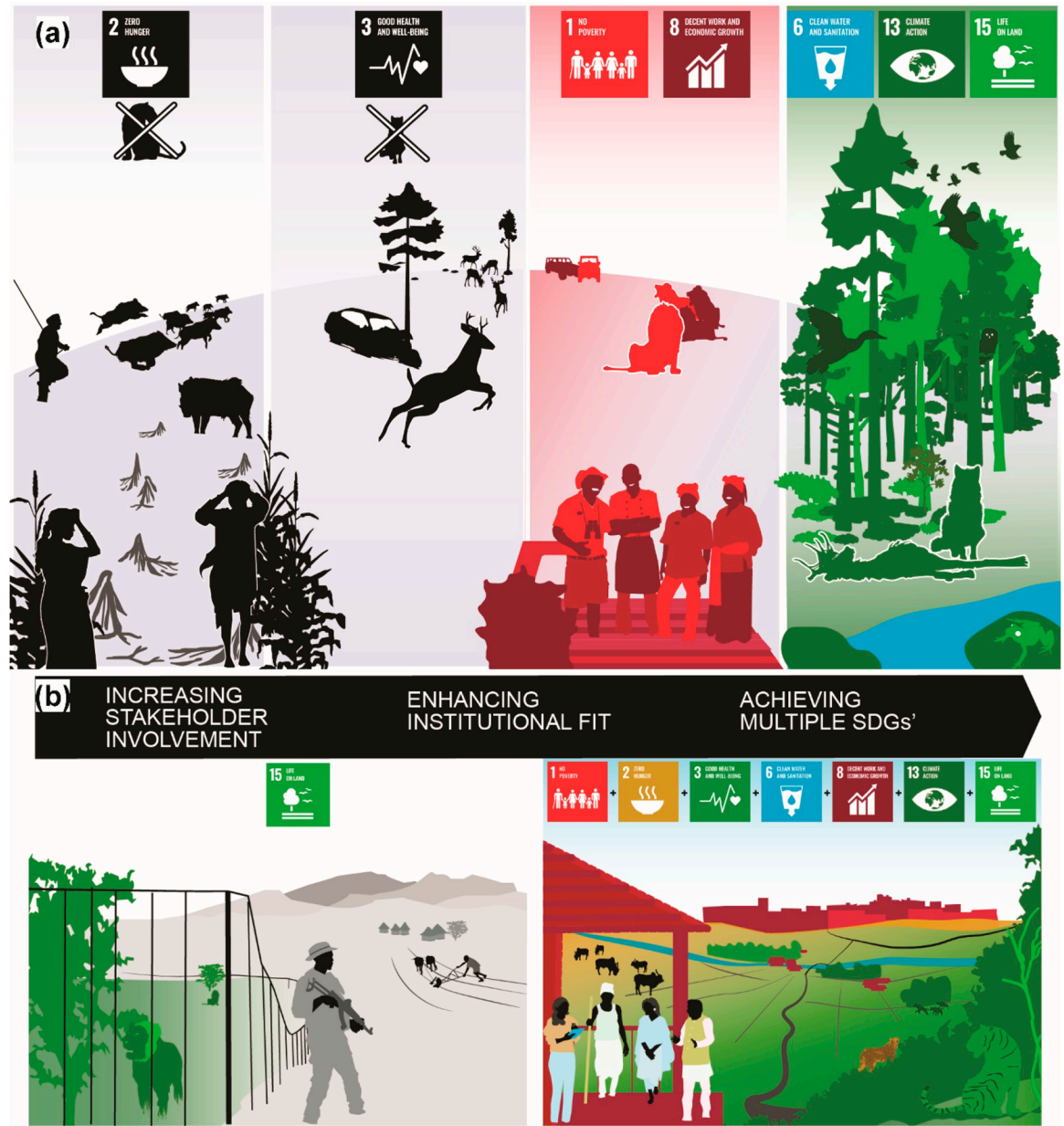
Fig 1. Enhancing the roles large carnivores play to help achieve the United Nations Sustainable Development Goals (SDGs). (a) How carnivores help achieve the SDGs. At left, carnivores are absent and thus ungulates, without predation pressure, may damage crops and collide with vehicles, slowing progress on SDGs. At right, carnivores are present and, if managed properly, can contribute to various SDGs, for example, by generating tourism revenues for local communities and maintaining healthy ecosystems. (b) Framework for coexistence between large carnivores and humans that can help maximize the SDGs. Moving from left to right, engaging more stakeholder groups can lead to better institutional fit to the local social-ecological system, creating greater opportunity to achieve multiple SDGs via carnivore presence in shared landscape.

https://doi.org/10.1371/journal.pstr.0000151.g001