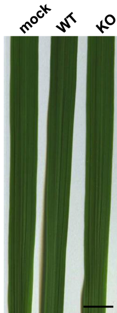
S17 Fig. Comparison of the incompatible interactions between WT and KO.