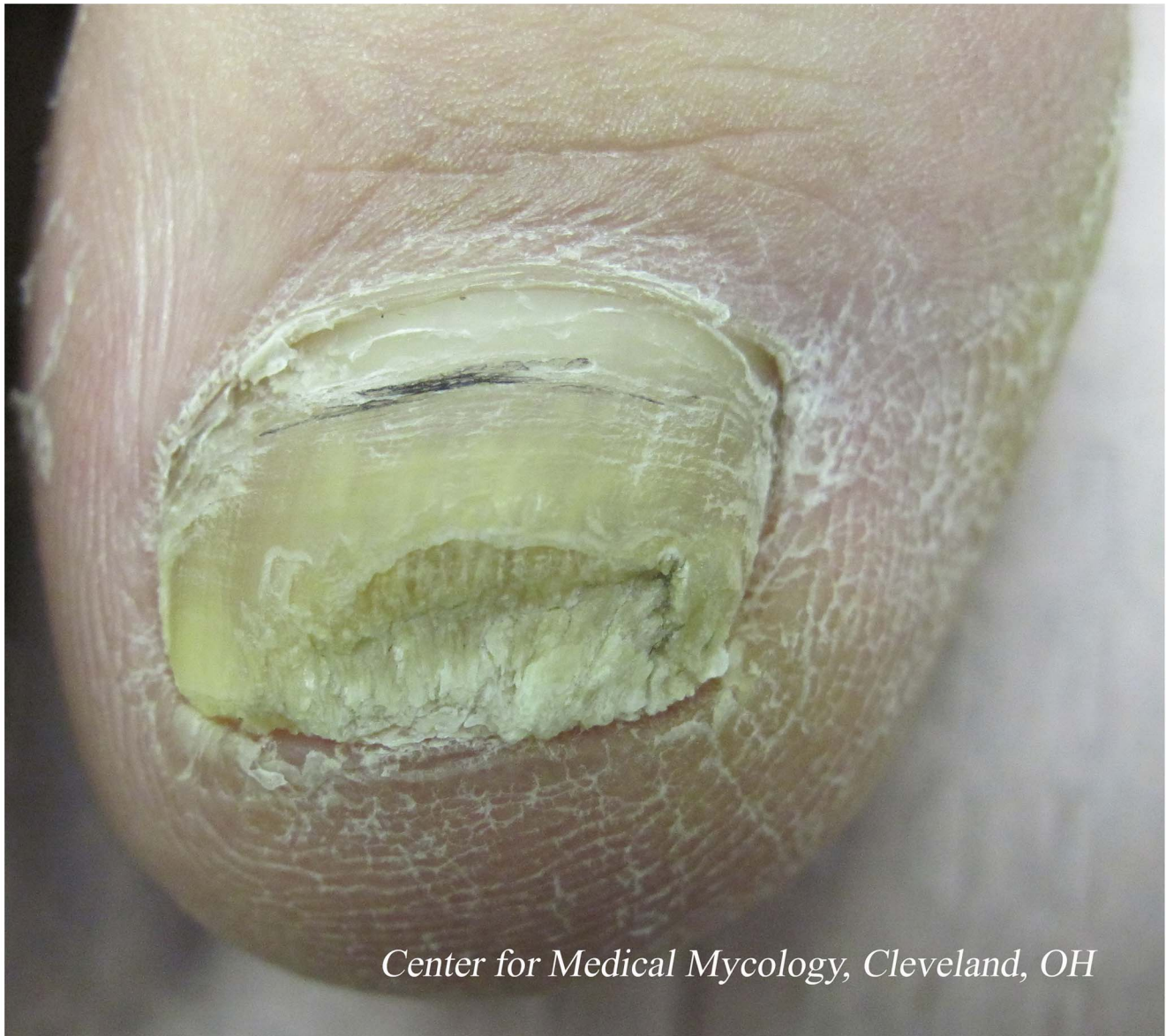
Figure 2. Distal subungual onychomycosis of the great toenail. doi:10.1371/journal.ppat.1004105.g002

technology does not differentiate between “live” and “dead” fungi, so even though these samples had to be reported as microscopy-positive, the infection may in fact have been cured. The authors propose that, for clinical trials of topical agents, the length of treatment should be extended to 18 months, followed by a longer washout period of 3–6 months before primary assessments to allow the removal of both residual drug in the nail and nonviable fungal cells. Therefore, the absence of clinical signs following an adequate wash out period, coupled with a negative culture, with or without negative microscopy, should be considered the definition of onychomycosis cure. These changes may enable more topical agents to be proven efficacious.