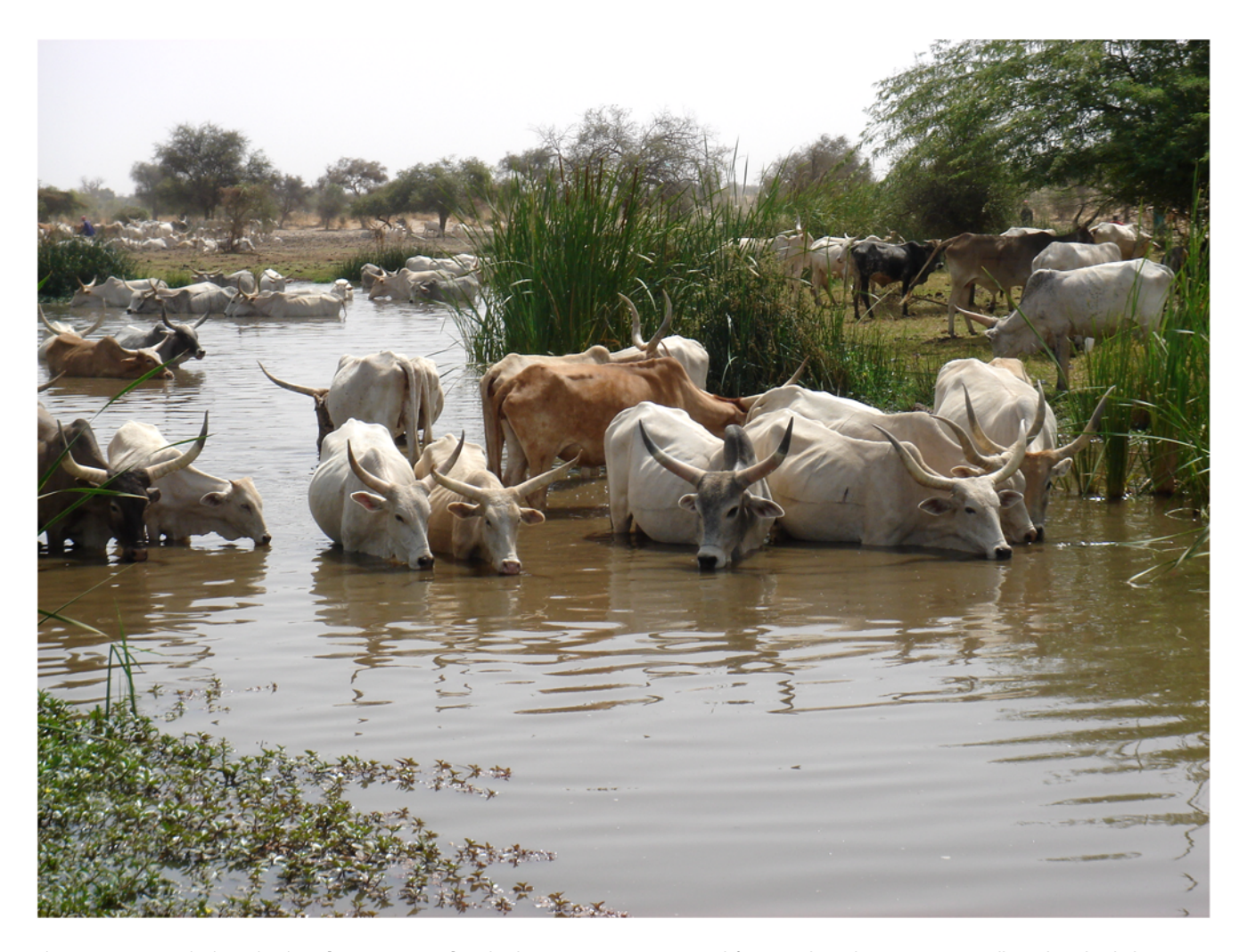
Figure 2. Transmission site in Mbane, Senegal. Hybrid parasites were recovered from snails (Bulinus truncatus) collected at this habitat. doi:10.1371/journal.ppat.1000571.g002

Another possibility is that the initial pairing between these two schistosome species occurred in a non-human mammalian host that can readily be infected by both species, such as rodents. Rodents are routinely used in laboratories to passage schistosome species, so they are likely to be susceptible in the wild too. However, Duplantier and Sene [31] studied 2000 animals