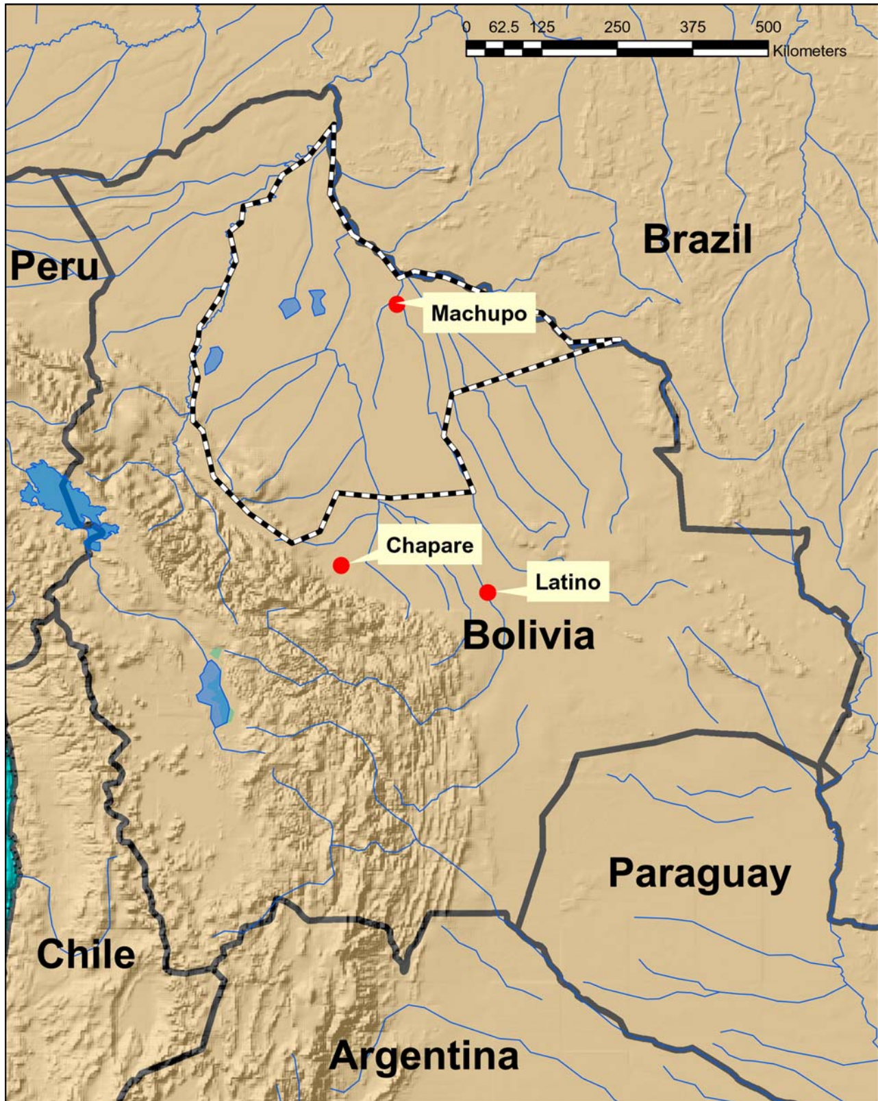
Figure 1. Map of Bolivia showing location of the Chapare virus-associated HF case relative to the Beni region where Machupo virus-associated HF cases originate. The Beni Department boundary is depicted by the checkered line. Multiple Machupo isolates have been recorded from the Beni Department. The single Latino and Chapare virus locations are labeled and represented as dots. doi:10.1371/journal.ppat.1000047.g001