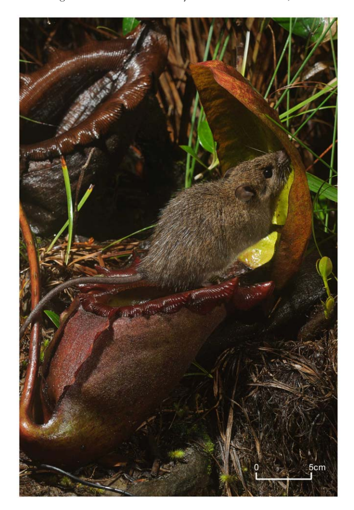
Figure 1. Rattus baluensis visiting a Nepenthes rajah pitcher at night. doi:10.1371/journal.pone.0021114.q001

All T. montana visits (n = 238) occurred during daylight hours, indicating that T. montana is strictly diurnal. In contrast, the 27 R.