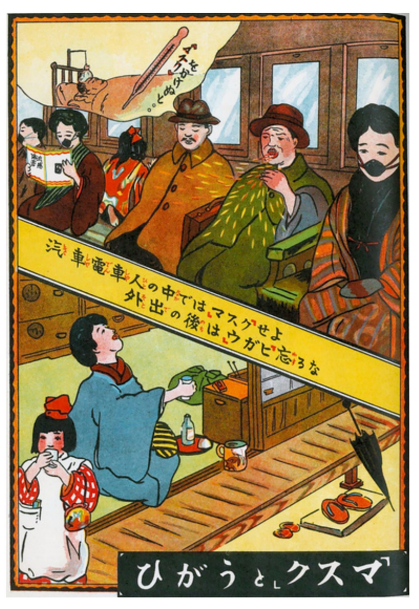
Fig 1. A poster promoting mask-wearing in Japan during the Spanish flu outbreak.

Competing interests: The authors have declared that no competing interests exist.