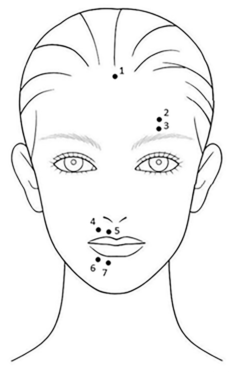
Fig 1. The points indicate where the electrodes were placed for each participant. Electrodes 2–3 recorded signals from the Frontalis muscle. Electrodes 4–5 recorded signals from the orbicularis oris superior muscle. Electrodes 6–7 recorded signals from the orbicularis oris inferior muscle. Electrode 1 was an unshielded grounding electrode.

https://doi.org/10.1371/journal.pone.0238920.g001