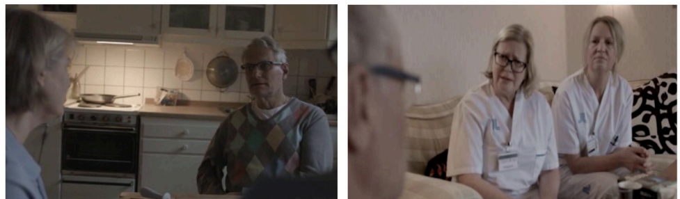
Fig 2. Screenshots from the video clips showing home visits by three different health professions—An occupational therapist on the left and a family physician and district nurse on the right.

The students provided feedback about their perceptions from working with the VP model both in the interviews and in the questionnaire. The answers in the questionnaire showed that