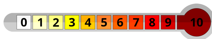
Fig 2. The Orgasmometer-F. Considering a Likert scale ranging from 0 to 10, where 0 corresponds to the absence of orgasmic perception and 10 to maximum perceived orgasmic intensity, how do you evaluate your orgasmic intensity in the last six months?

https://doi.org/10.1371/journal.pone.0202076.g001