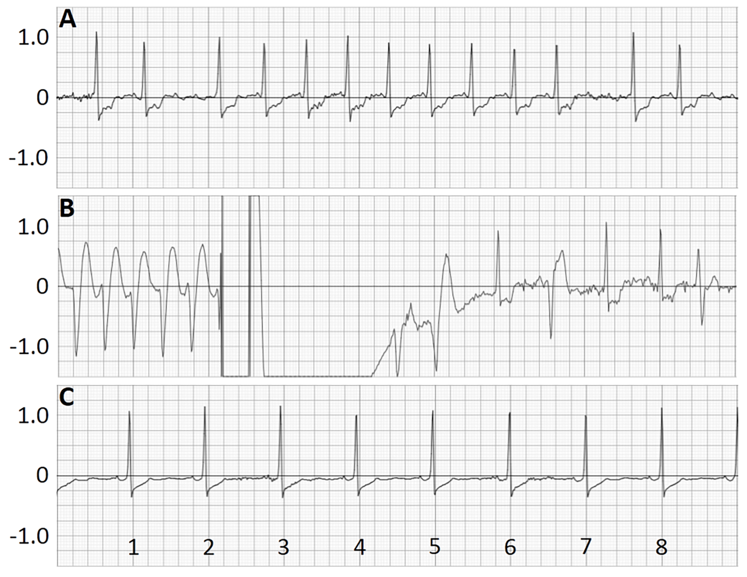
Fig 2. Electrocardiogram showing 9 seconds of data recorded by the WCD side-to-side channel electrodes. (A) Heart rhythm recorded by the WCD 4 days prior to VT. (B) Shock (150J) delivered by the WCD in response to sustained VT and recovery of sinus rhythm. (C) Heart rhythm recorded 7 days after delivery of shock. Recording speed (x-axis) is 25mm/second and amplitude scale (y-axis) is 1mv/20mm. Elapsed time (seconds) following the beginning of the recording are indicated.

https://doi.org/10.1371/journal.pone.0194496.g002