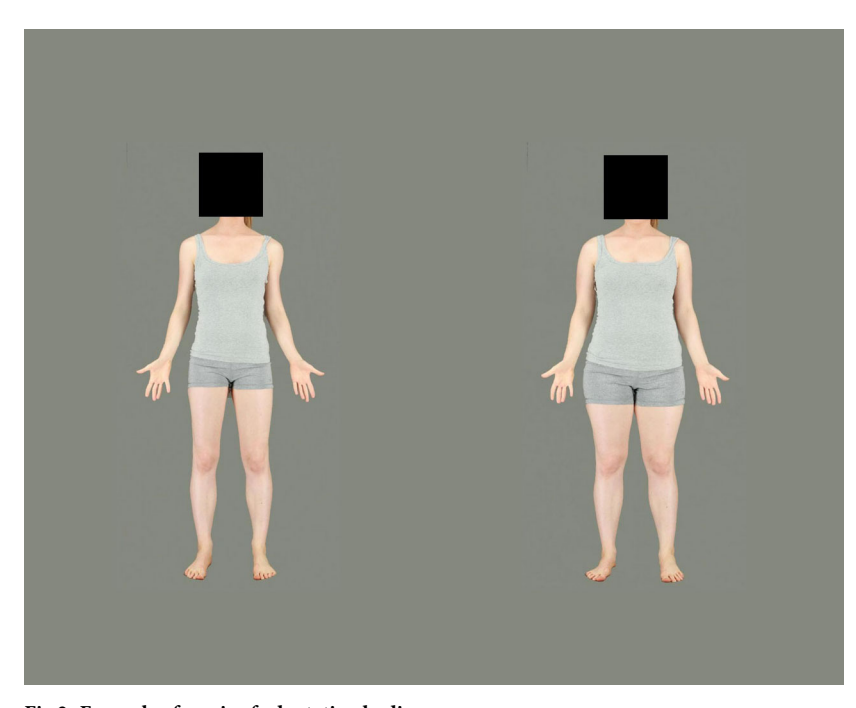
Fig 2. Example of a pair of adaptation bodies. https://doi.org/10.1371/journal.pone.0189855.g002

In the adaptation phase, participants were first shown an initial adaptation sequence involving a series of 10 pairs of same-identity bodies, consisting of one body manipulated to appear high in fat, and one body manipulated to appear low in fat (Fig 2). Each pair was presented twice, once with the low fat body on the left of the screen and once with the low fat body on the right side of the screen, in a random order. Each pair remained on the screen for 6 seconds,