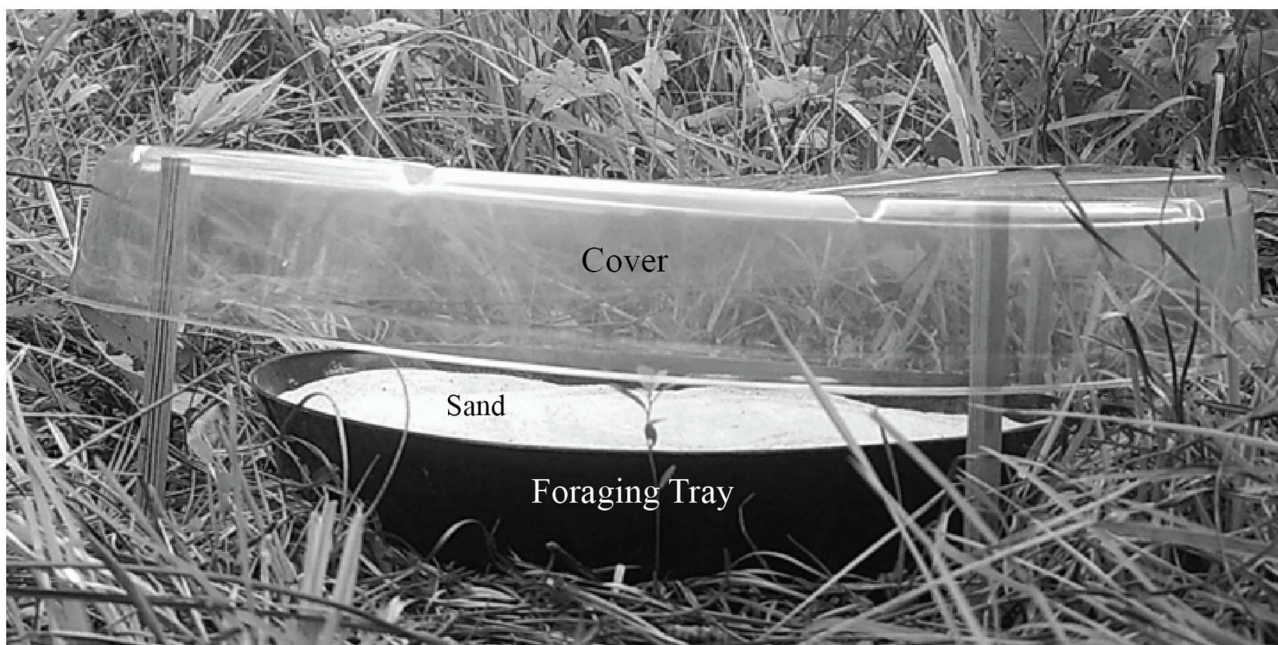
Fig 1. The resource patch design used to assess the influence of red-imported fire ants ( Solenopsis invicta ) on hispid cotton rats ( Sigmodon hispidus ) over four days from 13–15 August 2015.