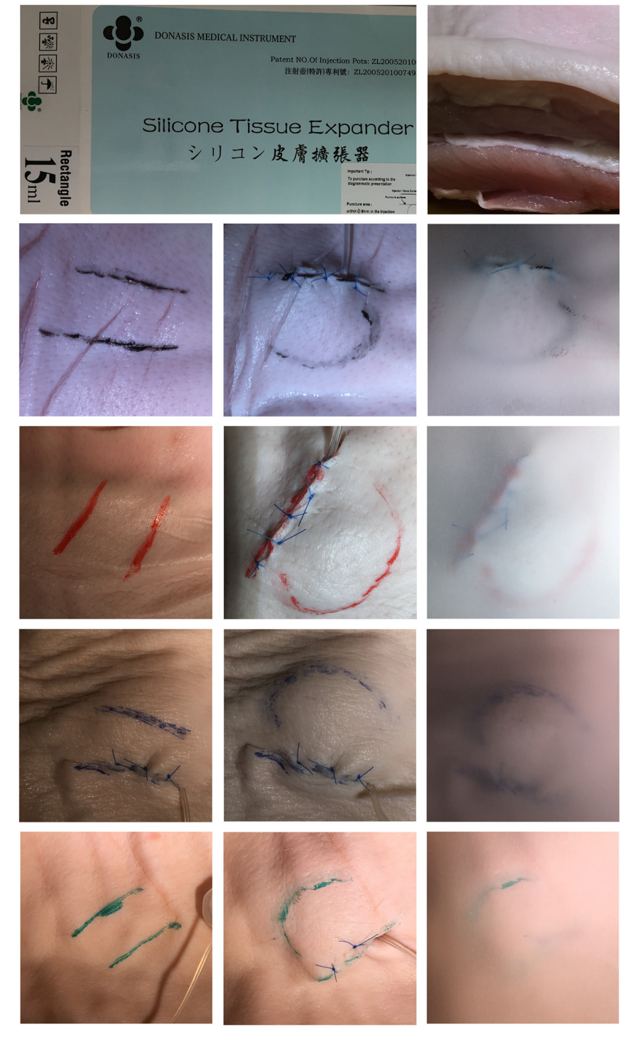
Fig 1. Image shows saline expander, pigskin anatomy and curves formed by the advancing front of rapid expansion.