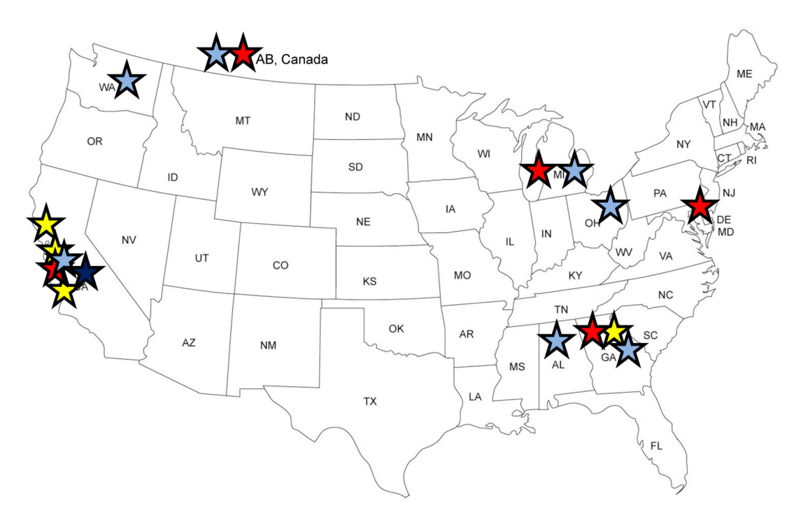
Fig 2. Implementation Sites By Year and Level of Curriculum Development, Stanford Youth Diabetes Coaches Program, 2012–2015. Yellow stars represent implementation of the original power point based curriculum in 2012–2013 with 3 residency programs at 8 high schools; red stars represent implementation of improved curriculum with the addition of various interactive elements with 3 residency programs, 3 high schools, and 1 summer camp in 2014–15; the dark blue star represents the pilot implementation of the technologically enhanced curriculum with 1 residency program and 1 high school in 2015; and light blue stars represent planned multi-site implementation of the technologically enhanced curriculum with 6 residency programs and 8 high schools.