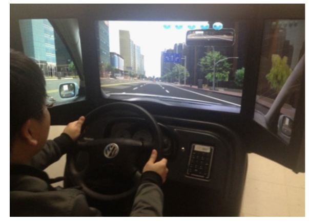
Fig 1. The driving simulator used in this experiment. doi:10.1371/journal.pone.0156948.g001

Driving environment. The simulated driving environment was a 3.6 km route of city streets [Fig 2]. Participants drove following audio instructions. In about one fifth of the route, the speed limit was 40 km/h, and it was 60 km/h for the rest of the route. Unexpected incidents sometimes happened. For example, a bike rider suddenly changed lanes to avoid parked cars