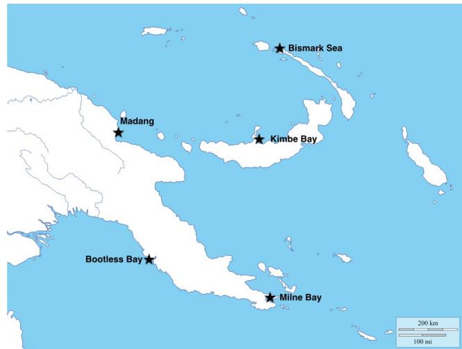
Fig 1. Location of sampling areas. Map downloaded and used with permission from http://www.d-maps.com .