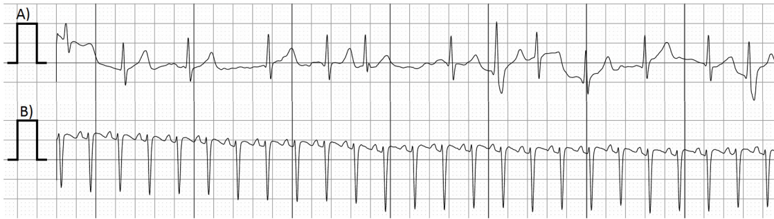
Fig 1. Samples of transmitted ECG tracings. A) Atrial fibrillation. B) Supraventricular tachycardia.