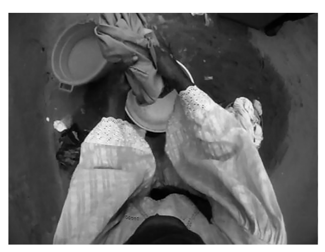
Fig 1. Field of view of video from Participant A, converted to grayscale. doi:10.1371/journal.pone.0136158.g001

factors influencing contamination and estimate subsequent risks of infection from interactions with the surface. By providing a framework for modeling individual-level exposure profiles, we provide insight into methods needed to better understand inter-individual variability in fecal-oral disease transmission.