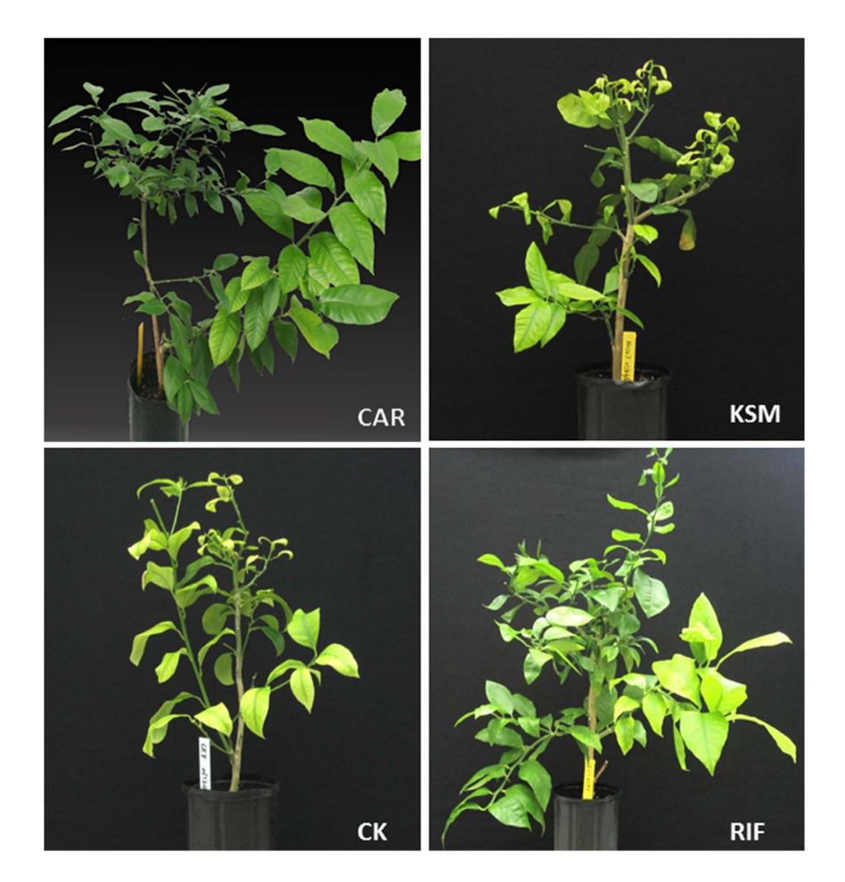
Figure 1. Huanglongbing (HLB)-affected grapefruit ('Duncan') plants with graft-inoculation of Las-infected lemon scions treated with different antibiotics. I-CAR: Highly effective compounds; II-RIF: Partly effective compounds; III-KSM: non-effective compounds; CK: water control. Photograph was taken 6 months after graft inoculation. Typical HLB symptom of leaf curl and corky veins on grapefruit rootstock and blotchy mottle or yellow shoots on leaves of lemon scion were apparent. doi:10.1371/journal.pone.0111032.g001

respectively), ACT and OXY was discarded from further analysis. Scions soaked in COL, LIN, SPT, and VAN had a 100% survival rate and more than 50.0% of scion growth. KSM, RIF and VAN had the highest percentages of scion growth (more than 85.0%). The control solvents resulted in approximately 91.0% of the scions surviving (Table 2).