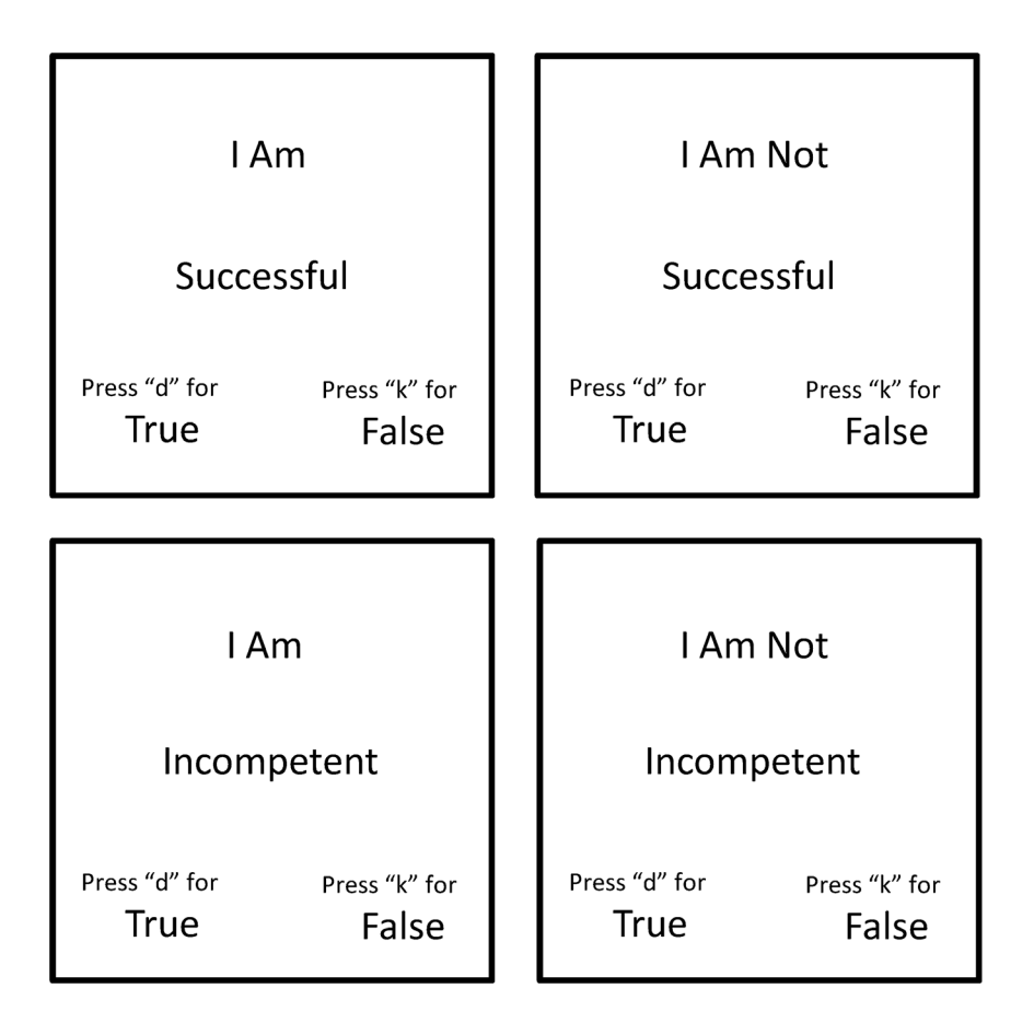
Figure 1. Examples of the four trial-types used in the actual self-esteem IRAP. On each trial, a label stimulus (e.g., 'I am' or 'I am not'), a target stimulus (e.g., 'Successful' or 'Incompetent') and two relational response options (True and False) were shown on the screen. Note: the ideal and actual self IRAPs were identical in all regards except for their respective label stimuli ('I want to be' and 'I don't want to be' versus 'I am' and 'I am not' respectively). doi:10.1371/journal.pone.0108837.g001

blocks they were presented with the message "Please respond AS IF I am positive and I am not negative" (self-positive block), while on the alternative set of blocks they were presented with the message "Please respond AS IF I am negative and I am not positive" (self-negative block). Stated more precisely, a correct response during self-positive blocks required participants to select 'True' when 'I Am' appeared with a positive target stimulus (e.g., 'Intelligent') or when 'I Am Not' appeared with a negative target (e.g., 'Stupid'). At the same time, participants were also required to choose 'False' when 'I Am' appeared with a negative word or when 'I Am Not' appeared with a positive target stimulus. The opposite pattern of responding was required during self-negative blocks. The general rule for responding was alternated across each IRAP block to form three successive pairs of test blocks.