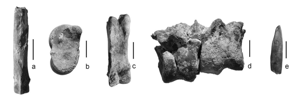
Figure 2. Selection of bones from Kom K and Kom W of each of the major domesticated animals. (a) Dog or wolf metapodial with cut marks (KK05-44) - volar view, (b) Sheep talus (KK03-27) - medial view, (c) Goat phalanx 1 (KK06-09) - volar view (d) Cattle distal metapodial (KK03-06) - dorsal or plantar view (e) Pig lower incisor (Kom W-back fill) - lateral view. Scale bar = 1 cm. Short legend: Bones from Kom K and Kom W of each of the major domesticated animals. doi:10.1371/journal.pone.0108517.g002

Hardly any data on ages at death are available for the cattle either. Kom K yielded one unfused distal metapodial, two fused first and one fused second phalanx. No reliable inferences can be made on this basis about slaughtering strategies, a recurrent problem for African archaeological sites that prevents demonstrating the use of cattle for secondary products like milk. Despite the lack of direct evidence, it has long been suspected that cattle milk was exploited by stock keeping communities of Africa from very early times [54,55,56,57]. In addition, from the Libyan Sahara there is now evidence through residue analysis of pottery for extensive processing of dairy products, although unspecified whether from cattle or caprines, during the Middle Pastoral period (approximately 5200-3800 BC) [58]. As is the case with the Fayum, the number of bones from domesticates at the site is extremely low compared to fish (Francesca Alhaique, Wim Van Neer, Monica Gala and Savino di Lernia, unpublished data).