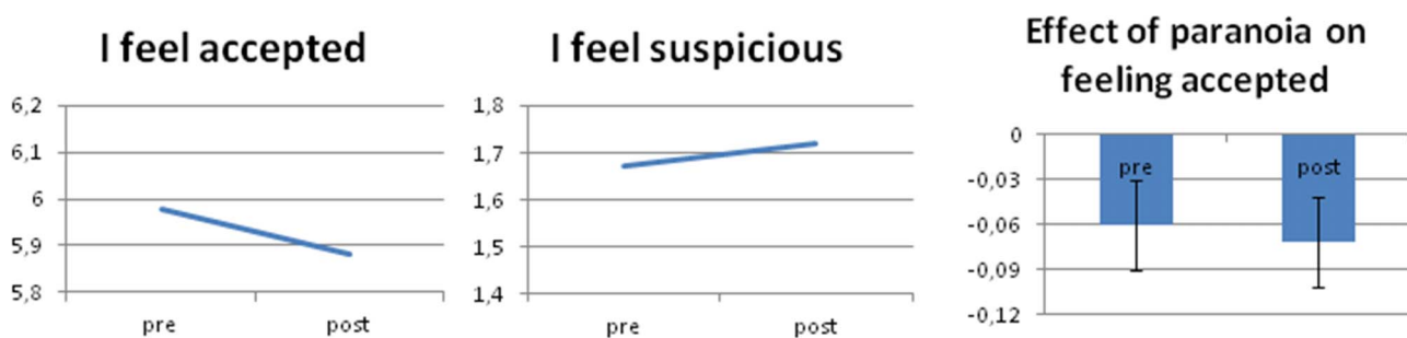
Figure 2. The effect of Mindfulness-based cognitive therapy (MBCT) on feeling accepted, feeling paranoid and their association compared to the control condition: Overview of the main results.