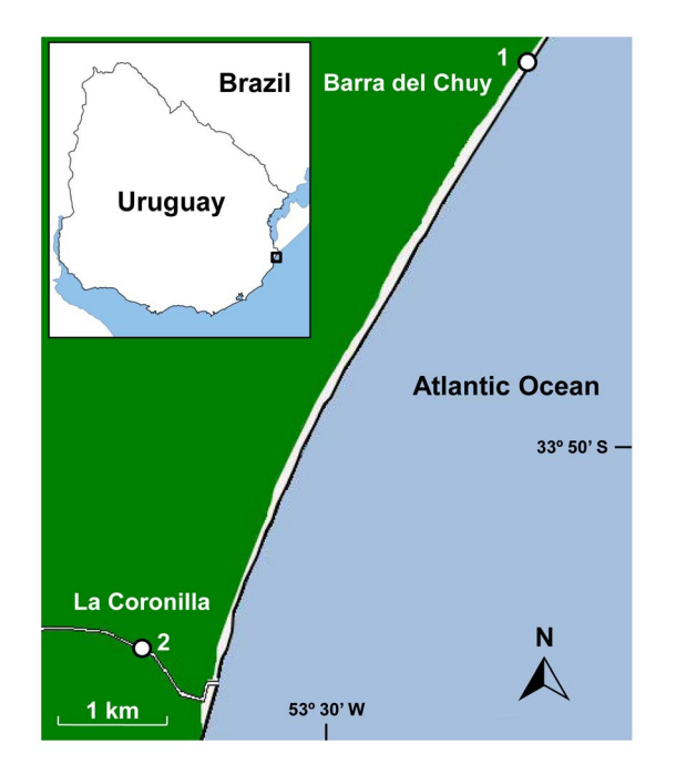
Figure 1. Study area. [(1)] Extraction site of bivalves in La Coronilla-Barra del Chuy sandy beach and [(2)] collection site of the effluent water in the Andreoni canal.

A purge time test was conducted in order to assess the time period for elimination of all the sediment stored inside the organisms. To this end, six replicates including five organisms each were placed in a 6 L container with artificial marine water (AMW) prepared at salinity values registered at the extraction site (salinity of 27 ppt) and left for 24 h. After this, bivalves were extracted and reincorporated in newly prepared AMW with the same previous salinity, for another 24 h purge period. The remaining water from each 24 h purge period was filtered through a 45 \mu m pore diameter filter and the retained sediment weighed to the nearest 0.001 g. The protocol was repeated until no sand was observed in