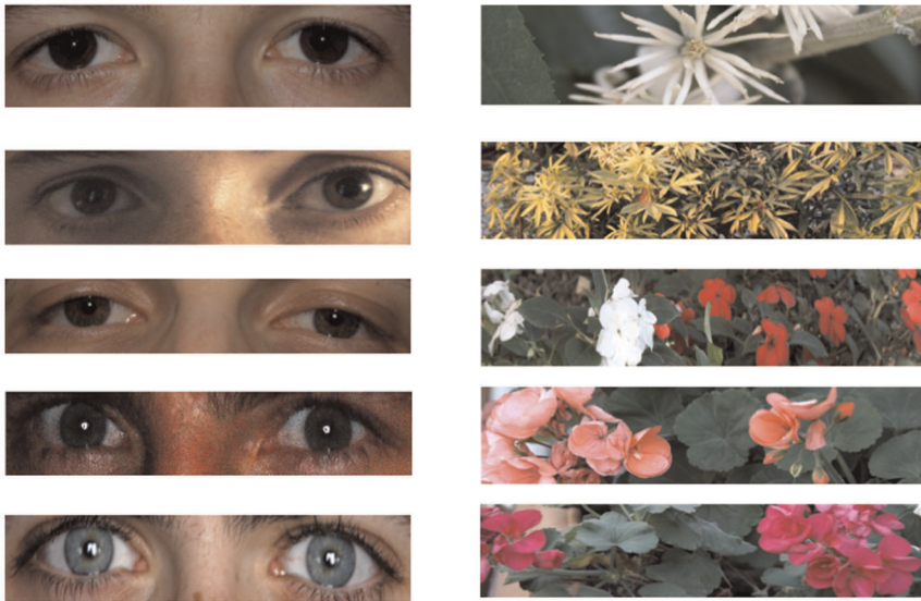
Figure 2. Treatments (images of eyes) and controls (images of flowers). doi:10.1371/journal.pone.0037397.g002

garbage are neutral to the treatment in the sense that it is not possible to assess the effects of the treatment on their behaviour. In a first step, we tested whether individuals invested more time in handling garbage in the presence of images of eyes compared to the control. In a second step, we investigated whether the amount of time invested was positively correlated to the number of items handled, the number of items placed into the correct bin or, the proportion of items placed into the correct bin (precision). Because of the low sample size of people that were willing to respond to our questionnaire, we included all available responses to the questionnaire in the analyses, including those of people that were excluded from the behavioural analyses because of methodological considerations (e.g., when the person was not alone during two minutes after arrival). As some individuals left with the bus before they had answered the full questionnaire we do not have the same amount of answers for each question (between 18–30 answers per question could be analysed). All results reported are two-tailed and were performed with SPSS version 16.0. P-values < 0.05 are considered as statistically significant and p-values \geq 0.05 but < 0.1 are reported as non-significant trends.