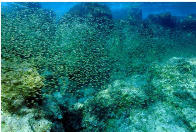
Figure 5. School of thousands of juvenile Siganus luridus at Kas, Turkey, after a massive recruitment event in September 2009. doi:10.1371/journal.pone.0017356.g005

The rapid growth of Cystoseira inside the cages was surprising because Cystoseira has relatively large zygotes, and its propagule dispersal is thought to happen over very small distances (on the order of meters) [20]. First, there may have been small Cystoseira bases in small anfractuosités on the substrate, which had not been grazed by fish and could have grown the thalli we observed inside the cages. Second, propagules may have sunk from the wave-washed zone (upper infralittoral), where there was a narrow belt of Cystoseira . In any case, the rapid growth of Cystoseira suggests that