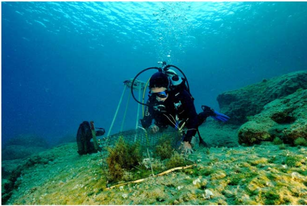
Figure 4. An exclusion cage at Kas in August 2009, five months after the beginning of the experiment. Inside the cage there is a well-developed algal assemblage, in contrast to the surroundings where only a few Padina pavonica stand out. doi:10.1371/journal.pone.0017356.g004

small filamentous algae that Siganus appear to be cropping in the barrens (which can be relatively high in other habitats such as coral reefs). Siganus grazing should increase the turnover ratio in the depauperate barrens (i.e. the production/biomass ratio of the micro-turfs) but at the same time decrease total primary production. In any case, grazing causes a loss of biogenic structure that implies a loss of habitat for most marine invertebrates that live in algal canopies and that are the main prey items of the major carnivorous fishes on this habitat (Labridae, Sparidae and Serranidae) [10,16], hence simplifying the food web. Siganus is directly transforming algae into faeces and shortcutting the complex Mediterranean food web at rocky infralittoral ecosystems [17,18,19].