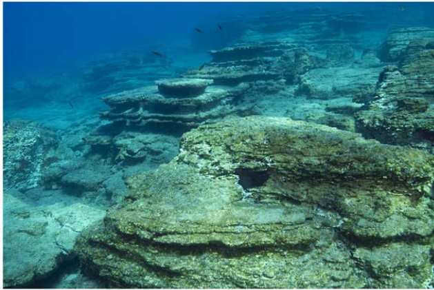
Figure 1. Infralittoral barrens at 10 m depth near Kas, Turkey, May 2008. Note the absence of erect algae and sea urchins. doi:10.1371/journal.pone.0017356.g001

significantly greater than at Fethiye and Bodrum ( p < 0.001 ), but there were no significant differences between Fethiye and Bodrum. Algae declined in summer at Fethiye and Kas, and after October in Bodrum.