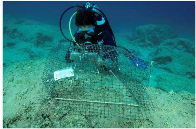
Figure 6. Experimental cages and surroundings, like this one at Kas, Turkey, were cleaned up by juvenile Siganus within a month. doi:10.1371/journal.pone.0017356.g006

recovery of algal assemblages is possible in the short term, should grazing pressure from Siganus be reduced.