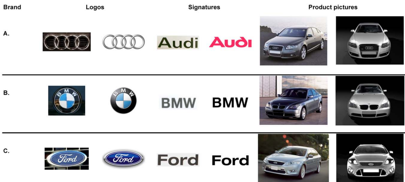
Figure 1. Images used to represent the brands AUDI, BMW, and FORD, varying according to the factor BRAND CUE.