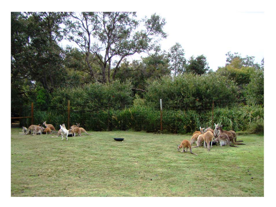
Figure 3. Cafeteria trials. Western grey ( Macropus fuliginosus ), red kangaroos ( Macropus rufous ) and agile wallabies ( Macropus agilis ) participating in cafeteria trials in Caversham Wildlife Park, Whiteman, WA. The treatment (dingo urine) is located beside the trough in the centre. Other treatments (feces, water) were rotated among troughs and position and differed according to day. doi:10.1371/journal.pone.0010403.q003

model in SPSS version 11.5 (SPSS Inc., Chicago, IL, U.S.A.) to all response variables. Tukey's HSD post hoc analysis was applied to within- subject treatments (e.g., urine, feces, control). A linear regression was fitted to assess whether elapsed days explained variation in participation rate. We calculated d -scores [51] to identify effect size of comparisons between treatments. All tests were two-tailed, we set our \alpha = 0.05 . Means are given \pm SEM.