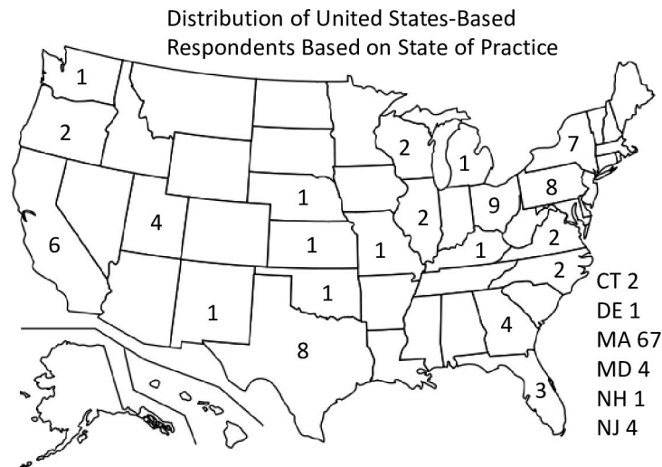
Fig 1. Distribution of United States-Based Respondents Based on State of Practice. Figure developed based on an image that is in the public domain, https://en.wikipedia.org/wiki/File:Blank_US_map_borders.svg [17].

https://doi.org/10.1371/journal.pone.0299516.g001