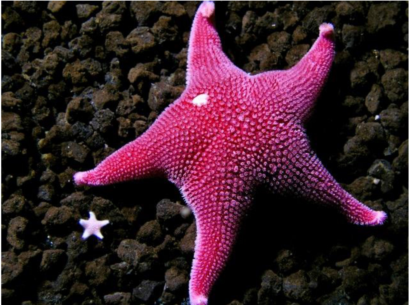
Fig 2. Healthy individual of Odontaster validus (stage 0, no disease). McMurdo Intake Jetty, Antarctica, 2019.

https://doi.org/10.1371/journal.pone.0282550.g002