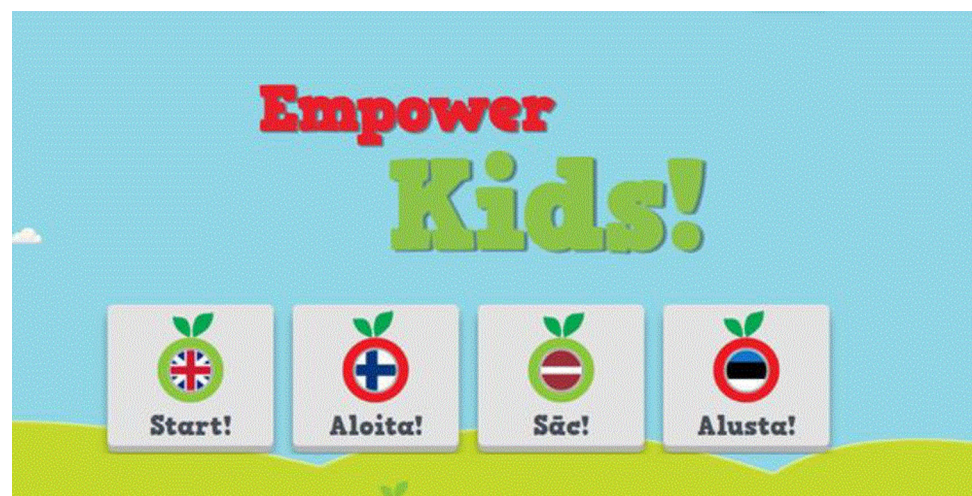
Fig 3. Children's interface of the EmpowerKids tool.

The tool was designed with two user interfaces: one for the child (Fig 3) and one for the professional. It consisted of four sections: physical activity, nutrition, family and personal resources and daily rhythm. In the physical activity and nutrition sections (Fig 4), the child made choices based on their personal health behaviors by picking suitable apples (containing alternatives) for the baskets. In the daily rhythm section, the child made choices based on their personal habits (e.g., hygiene routines, hobbies, meeting friends), by picking suitable apples (containing alternatives) for the baskets. The baskets stood for the frequency of the habit (“every day,” “a few times a week,” “once a week,” “sometimes”). In the resources section, the child scored different statements (n = 15) by choosing facial expressions that were based on a 4-point Likert scale (from “I agree” to “I disagree”). A 4-point Likert scale was chosen based on the views of the health professionals, social workers and preschool teachers. Literature among children has shown the reliability and validity of 4-point Likert scales [52]. The children were instructed to choose a face (from a smiley face to a sad face) that best described their level of agreement with each statement (e.g., “I feel safe,” “I feel good at home,” “I enjoy learning”) by expressing strong or mild agreement or disagreement. The scale was developed based