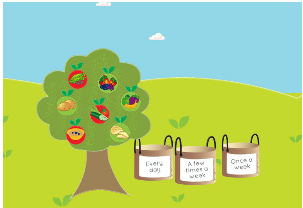
Fig 4. Nutrition section of the EmpowerKids tool.

https://doi.org/10.1371/journal.pone.0265355.g004