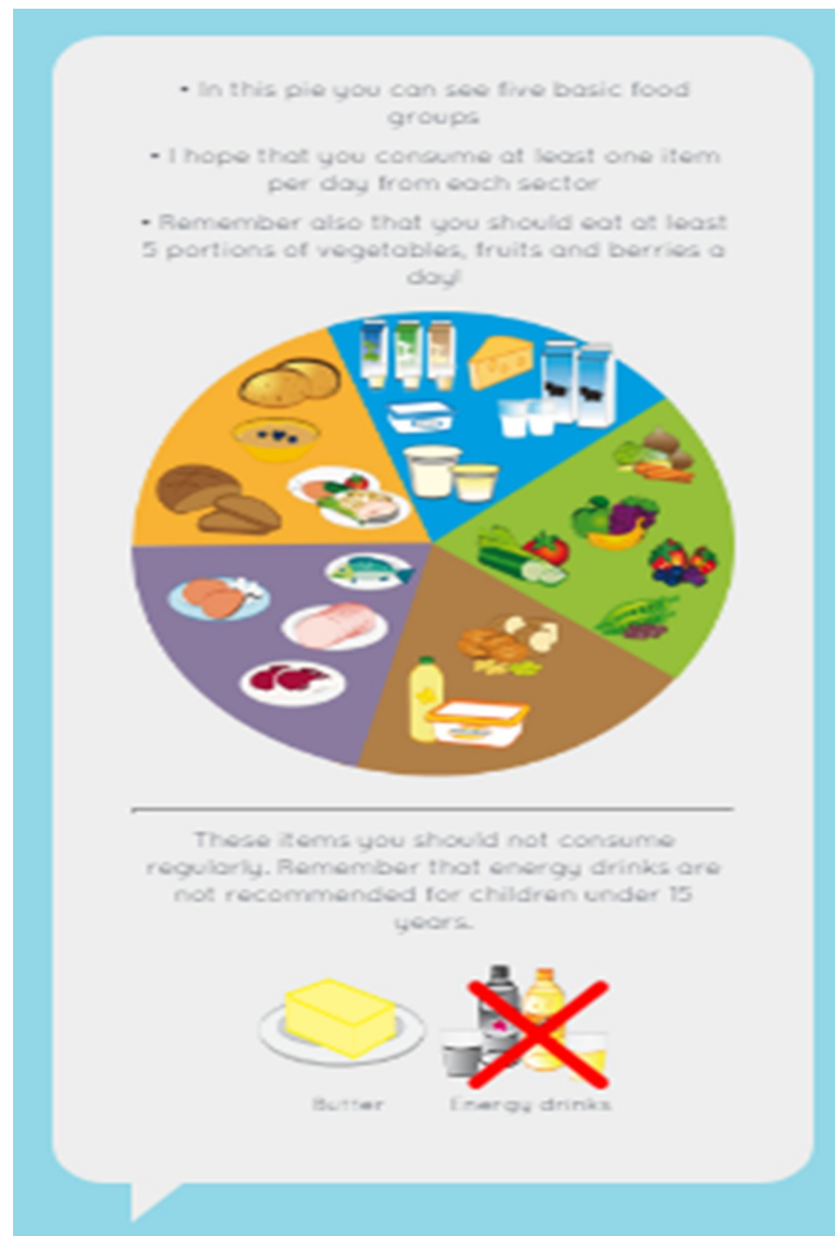
Fig 6. Feedback for healthy nutrition.

https://doi.org/10.1371/journal.pone.0265355.g006