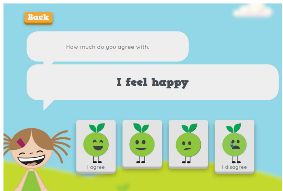
Fig 5. Resources section of the EmpowerKids tool.

on previous literature covering subjective and objective aspects of child wellbeing [e.g., 53–55] and involved experts in health research along with professionals working with children from the fields of health, social work and education. The set of statements included was proposed to represent the physical, emotional/psychological, social, educational and economic wellbeing of the child (Fig 5).