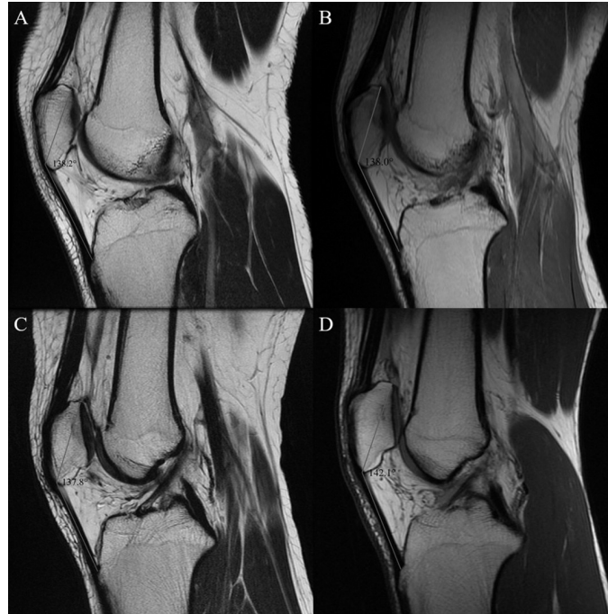
Fig 1. Measurements and comparison of patella-patellar tendon angle (PPTA) in patients who complained anterior knee pain. In study group, measured PPTA on sagittal proton density-weighted images was (a) 138.2° in a 21-year-old man with medial patellar plica syndrome, (b) 138.0° in a 22-year-old man with chondromalacia patella, and (c) 137.8° in a 21-year-old man with infrapatellar fat pad syndrome. (d) However, in a 22-year-old man with no abnormality on MRI and diagnostic arthroscopy, the PPTA was 142.1° which was significantly higher than that of patients in study group.

https://doi.org/10.1371/journal.pone.0265331.g001