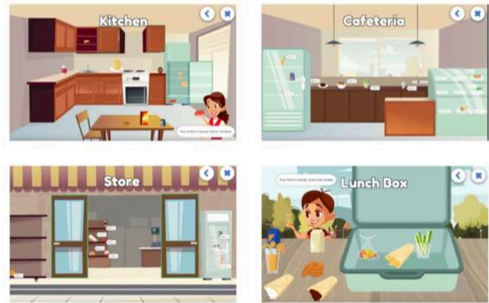
Fig 2. Examples of different scenarios and choice tasks from the choice experiment.

https://doi.org/10.1371/journal.pone.0264963.g002