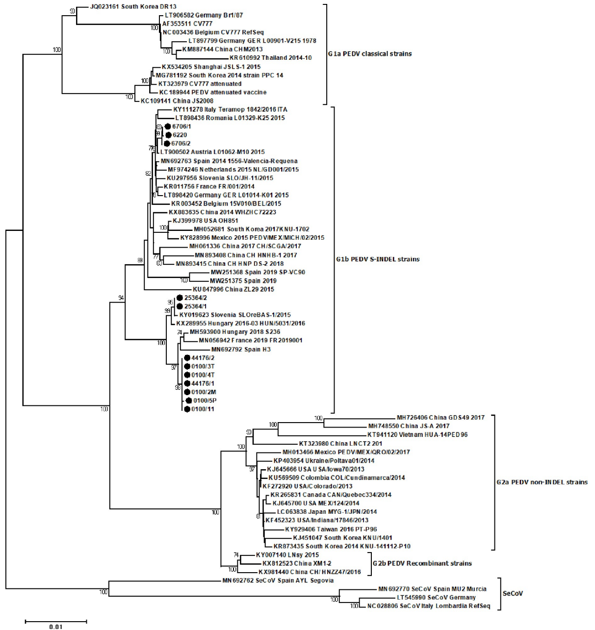
Fig 2. Phylogenetic relationship between the sequences of PEDV Polish strains and sequences of reference strains obtained from GenBank. The phylogenetic tree was constructed on the basis of the complete S gene sequences with MEGA6 software using the neighbor-joining method. Bootstrap values >70 are shown. The numbers of each branch represent the bootstrap value calculated using 1000 replicates. The scale bars indicate nucleotide substitutions per site. The S gene sequences from the PEDV isolates identified in this study are indicated with filled black circles.

https://doi.org/10.1371/journal.pone.0258318.g002