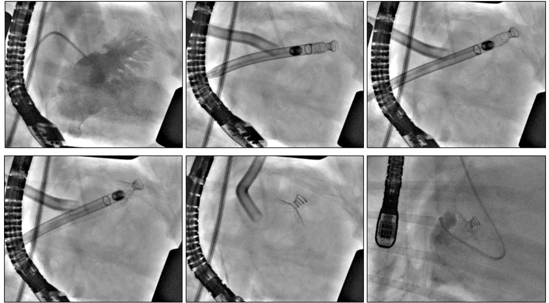
Fig 2. In vivo deployment of the StrokeShield device. Fluoroscopic images from 60-day chronic animal study showing in vivo deployment of the StrokeShield device. Panels A-E were obtained at baseline/implant and panel F at day-60 (terminal study). A, contrast dye injection into the LA showing the LAA. B, Direct surgical approach via the LA dome for placement of the StrokeShield device. The device is loaded on the tip of the delivery tool with partial exposure of the conical coil. C, StrokeShield device screwed into the LAA myocardium with delivery tool pullback in progress. D, Partial opening of the StrokeShield Nitinol umbrella. E, Complete opening of the StrokeShield Nitinol umbrella in place in the LAA ostium. F, StrokeShield device at day-60. Contrast dye injected via a ventriculogram catheter into the LA chamber shows no dye flow into the collapsed LAA. Panel F, originally obtained in right lateral decubitus position, has been flipped horizontally to match the left lateral decubitus position (right thoracotomy) of panels A-E.

https://doi.org/10.1371/journal.pone.0253299.g002