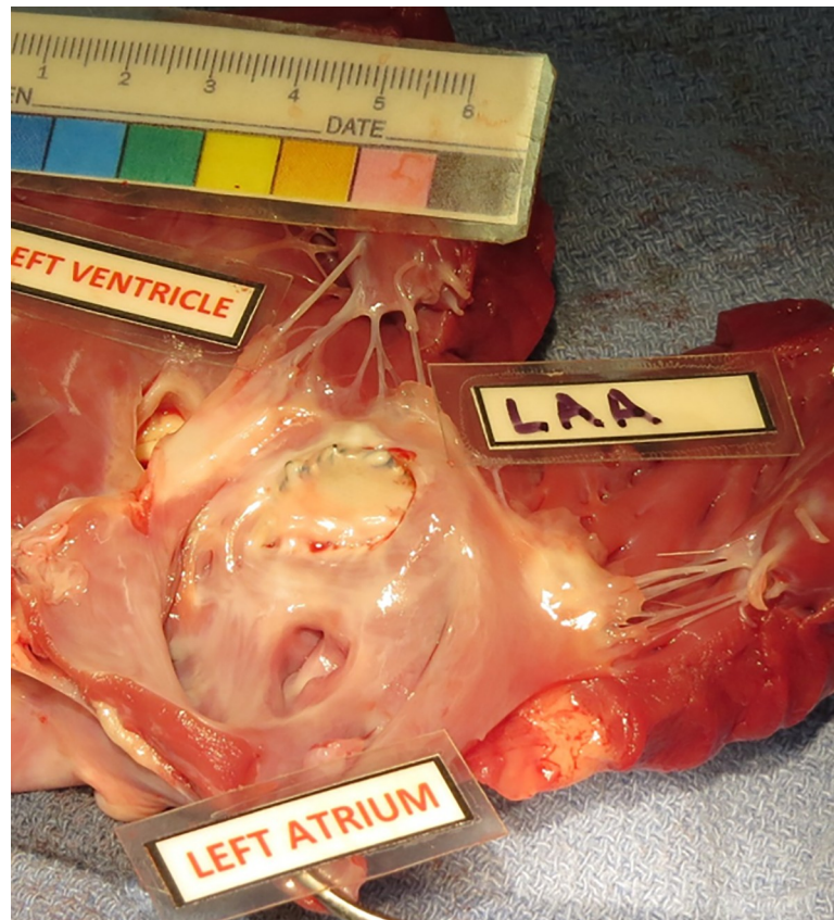
Fig 3. StrokeShield device in situ . The StrokeShield device in the LAA at necropsy (day 60) in the chronic canine model demonstrating tissue encapsulation and freedom from interference with the mitral valve and pulmonary veins.

https://doi.org/10.1371/journal.pone.0253299.g003