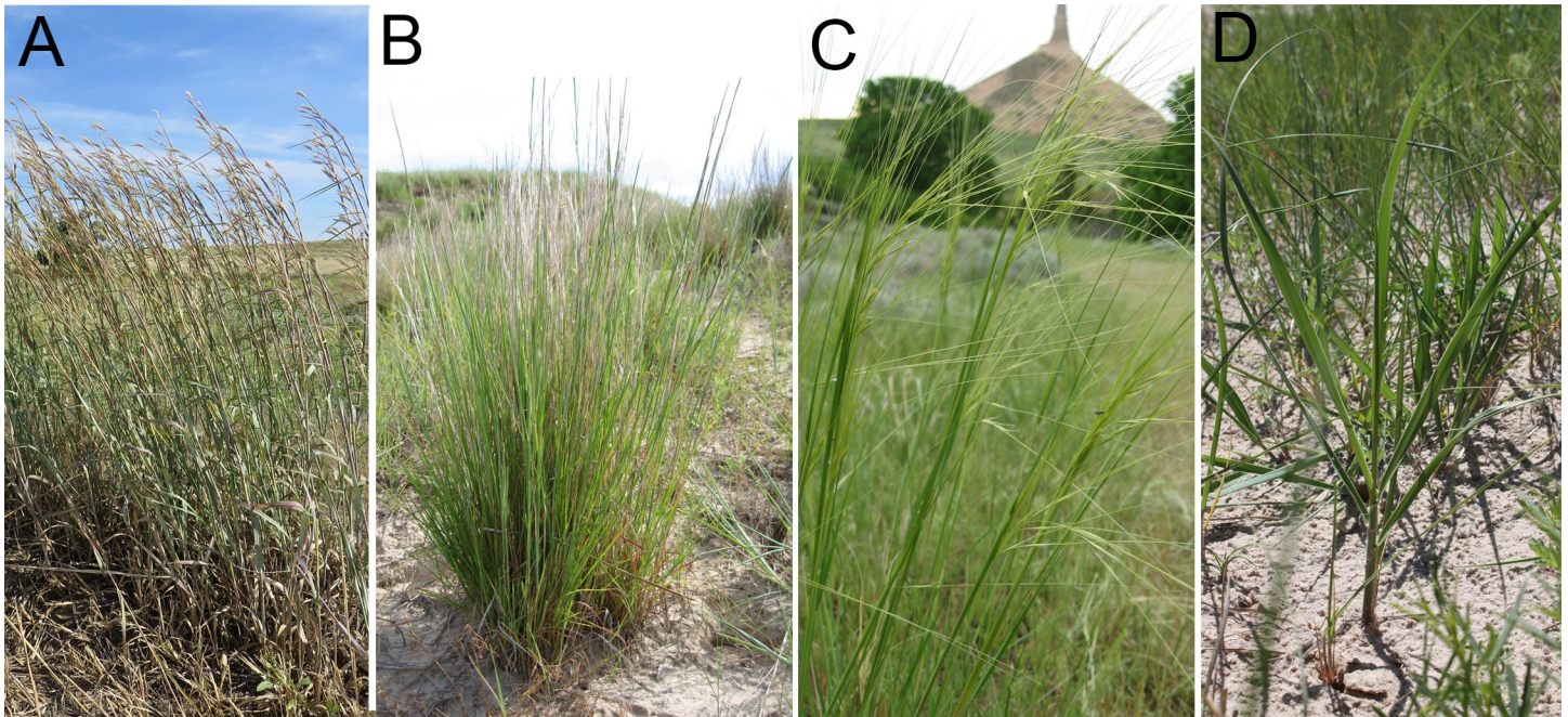
Fig 2. Grasses surveyed in the study. Shown are: A) sand bluestem ( Andropogon hallii Hack), B) little bluestem ( Schizachyrium scoparium ), C) needle-and-thread ( Hesperostipa comata ), and D) prairie sandreed ( Calamovilfa longifolia ).

https://doi.org/10.1371/journal.pone.0249335.g002