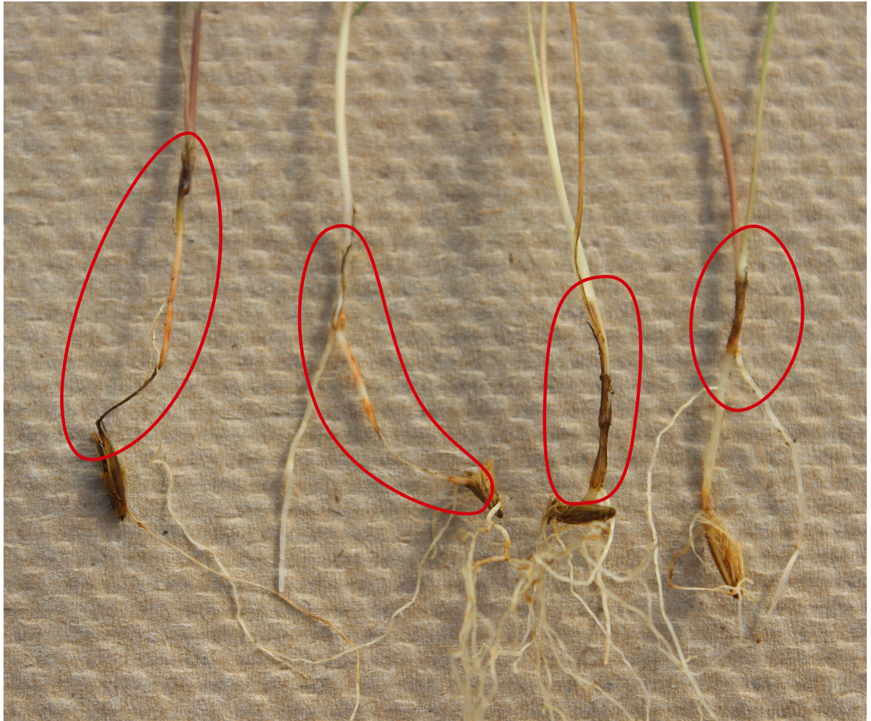
Fig 3. The circled areas indicate necrotic lesions and reddish-brown discoloration on the sheath, crown and root of 36-day-old sand bluestem grass which had been inoculated with two agar plugs of 7-day-old binucleate Rhizoctonia isolate AG-B, GR2057.

https://doi.org/10.1371/journal.pone.0249335.g003