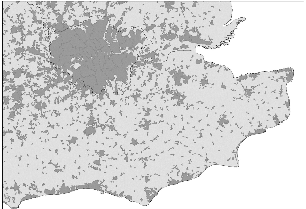
Fig 1. Built-up areas in London and the South East of England.

https://doi.org/10.1371/journal.pone.0248982.g001