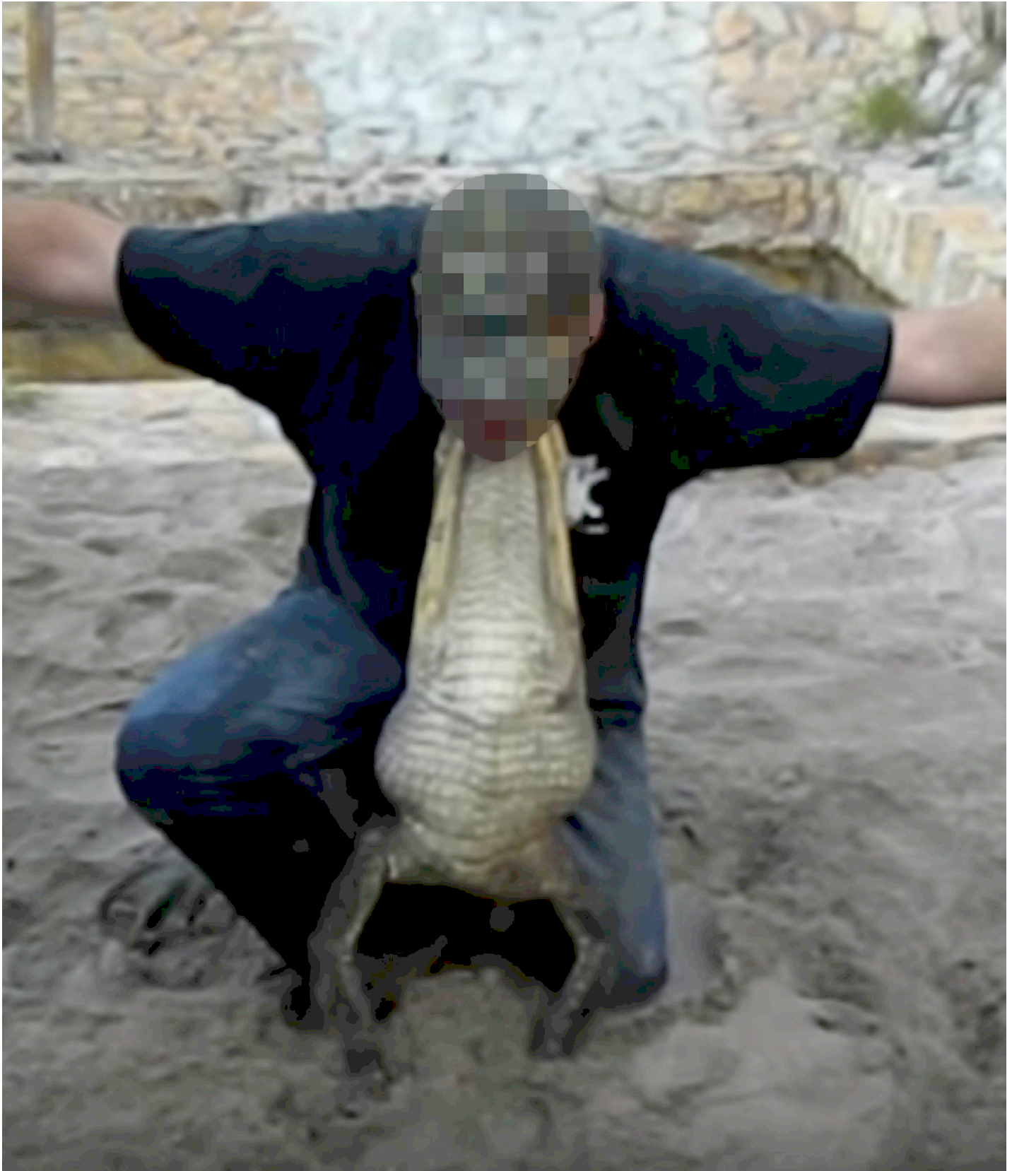
Fig 2. The “Bulldogging” stunt. Image captured from a video in the dataset.

https://doi.org/10.1371/journal.pone.0242106.g002