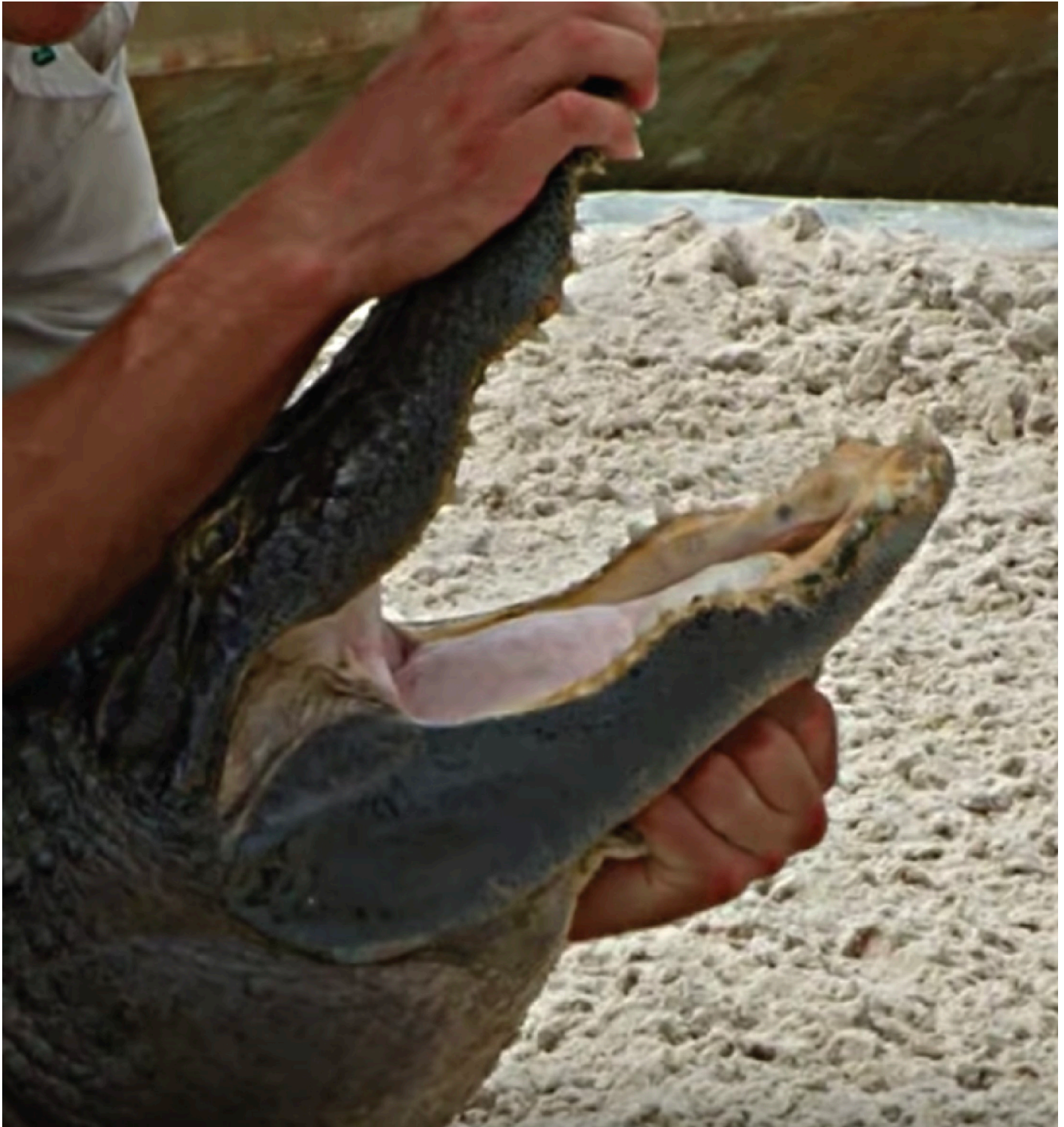
Fig 1. The “Florida Smile” stunt. Image captured from a video in the dataset.

https://doi.org/10.1371/journal.pone.0242106.g001