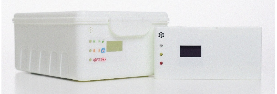
Fig 1. Picture of the electronic medication monitor device used for notified people with TB in the 30 selected counties of China. * * size: 16cm×12.5cm×7.3cm.

https://doi.org/10.1371/journal.pone.0232337.g001