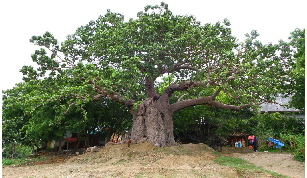
Fig 1. General view of the baobab of Jhunsi, near Allahabad.

https://doi.org/10.1371/journal.pone.0227352.g001