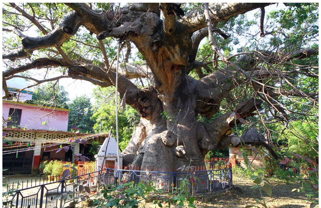
Fig 5. A view of the baobab of Kintoor, highlighting its huge branches.

obtained fraction modern values were finally converted to a radiocarbon date. The radiocarbon dates and errors were rounded to the nearest year.