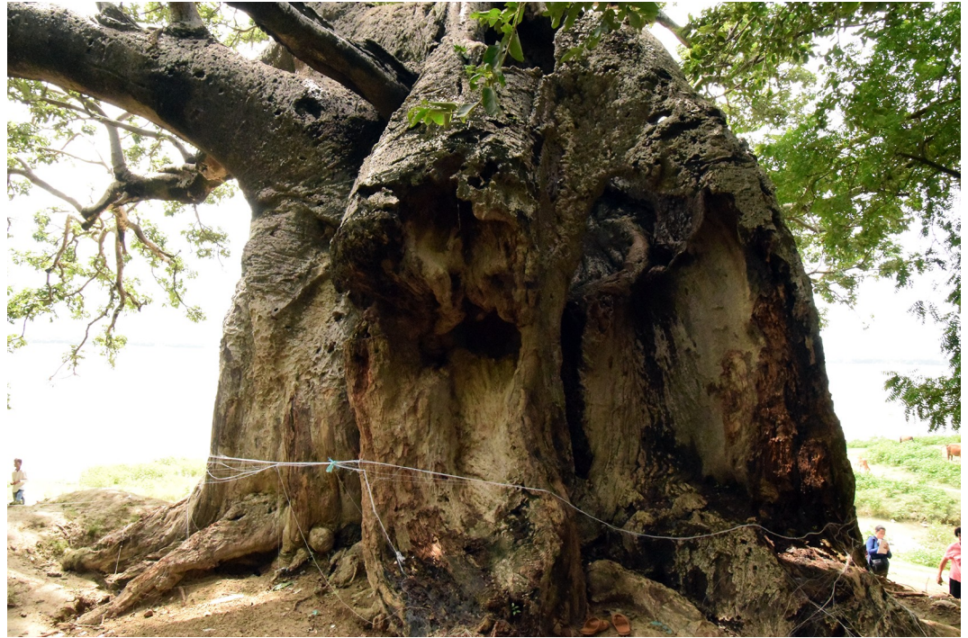
Fig 2. The image shows the two stems of the Jhunsi baobab which were damaged during fire in 2013.

https://doi.org/10.1371/journal.pone.0227352.g002