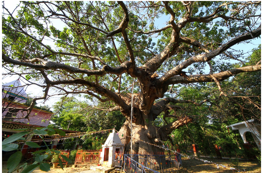
Fig 4. General view of the Parijaat tree at Kintoor.

https://doi.org/10.1371/journal.pone.0227352.g004