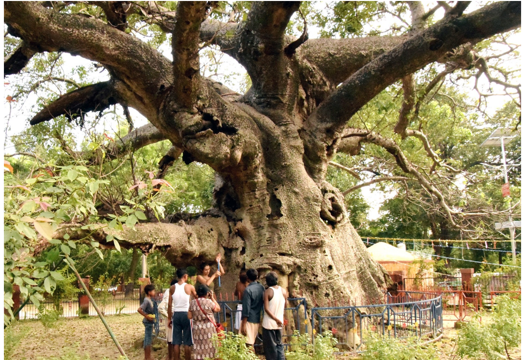
Fig 6. Collecting sample PK-1 from the Parijaat tree.

https://doi.org/10.1371/journal.pone.0227352.g006