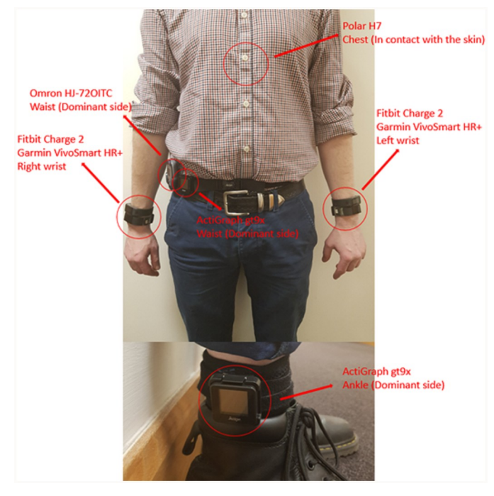
Fig 1. Devices positioning. Polar H7, Fitbit Charge 2, Garmin VivoSmart HR+, ActiGraph GT9X-BT, Omron HJ-72OITC. Philips Health Watch and Withings Pulse Ox are not illustrated in the picture but are worn in the same position of the Fitbit and Garmin devices.

https://doi.org/10.1371/journal.pone.0216891.g001