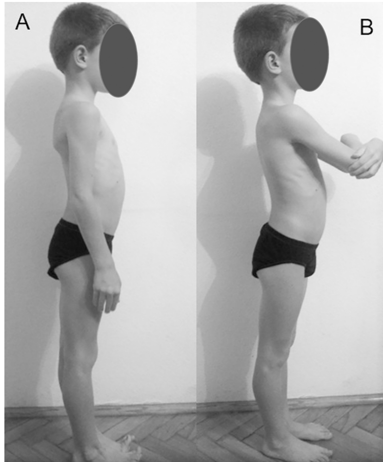
Fig 1. Standing positions. A: standing position with lowered arms: a natural standing position with the arms lowered loosely at the sides of the trunk. B: standing position with raised arms: a natural standing position with the arms raised to 45° in the sagittal plane and with hands grabbing the opposite side elbows.

https://doi.org/10.1371/journal.pone.0200245.g001