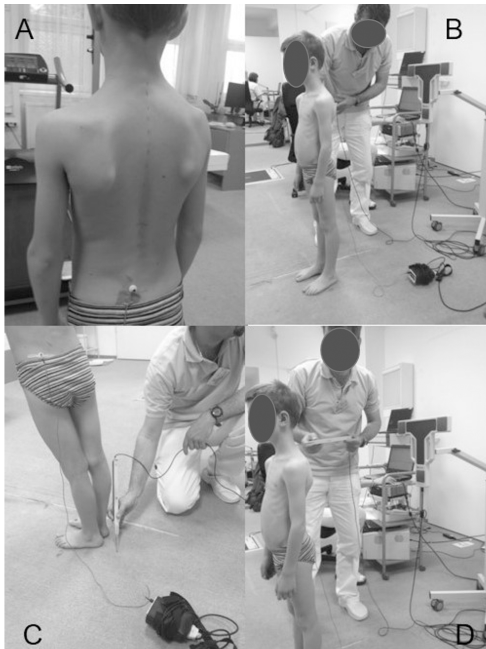
Fig 2. Steps of the measurement. A: placing the reference marker on the skin of the easily palpable part of the pelvis and marking the acromion, the angulus inferior scapulae, the spina iliaca posterior superior, the thoracic 12 (Th12) and the lumbar 1 (L1) on both sides. B: positioning the subject in front of the measurement head with the back facing it. C: calibration: defining the global coordinate system by marking four points on the ground with the pointer stick. D: determining the positions of the spinous processes with the pointer stick between vertebrae C7-S1.

https://doi.org/10.1371/journal.pone.0200245.g002