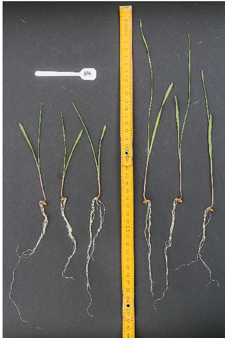
Fig 3. Reaction seedlings of line S44 to treatment by GA 3 . The seedlings on the left side of the ruler were treated with water and on the right side with GA 3 solution.

https://doi.org/10.1371/journal.pone.0199335.g003