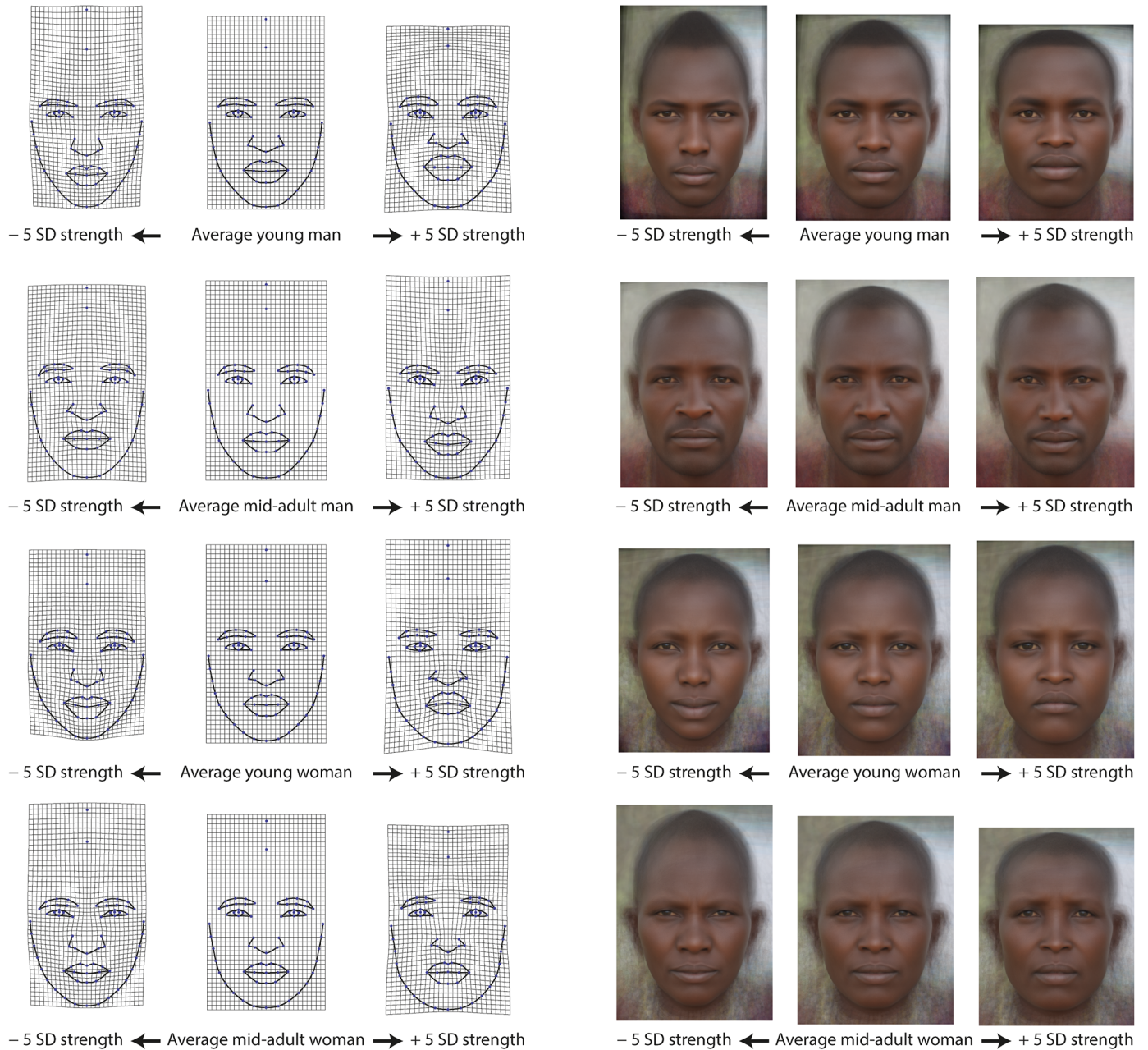
Fig 3. Facial shape correlates of handgrip strength (HGS) in the Maasai. Thin-plate spline deformation grids (on the left) depict the facial shape changes with HGS as deformations from the average facial configuration (middle column) to -5 SD of HGS (left column) and to +5 SD (right column), separately for each sex-age group. This magnification factor was applied to facilitate interpretation. The same facial configurations were also visualized through image unwarping and averaging (on the right). Thin-plate spline deformation grids and facial morphs were aligned at the height of the pupils and scaled for interpupillary distance.

https://doi.org/10.1371/journal.pone.0197738.g003