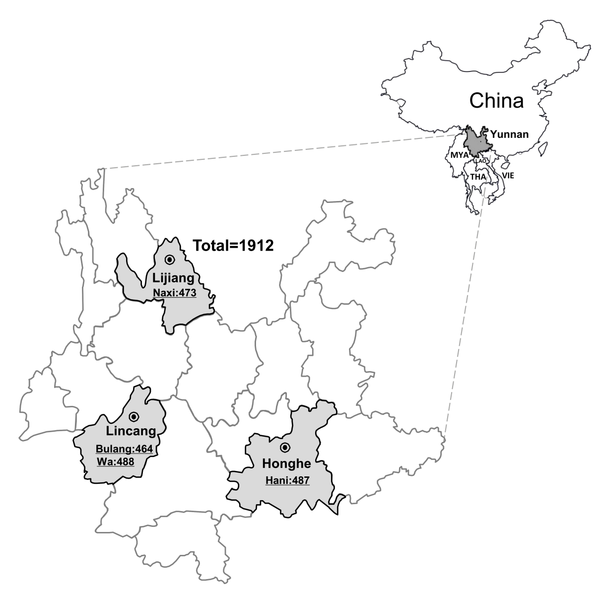
Fig 1. Maps of the study region and geographical distribution of subjects from all three prefectures of the Yunnan province of southwestern China. The Yunnan province of southwestern China is marked in dark gray, the Lijiang prefecture, Lincang prefecture, and Honghe prefecture are highlighted in light gray, respectively. MYA: Myanmar; THA: Thailand; LAO: Laos; VIE: Vietnam.

https://doi.org/10.1371/journal.pone.0197577.g001