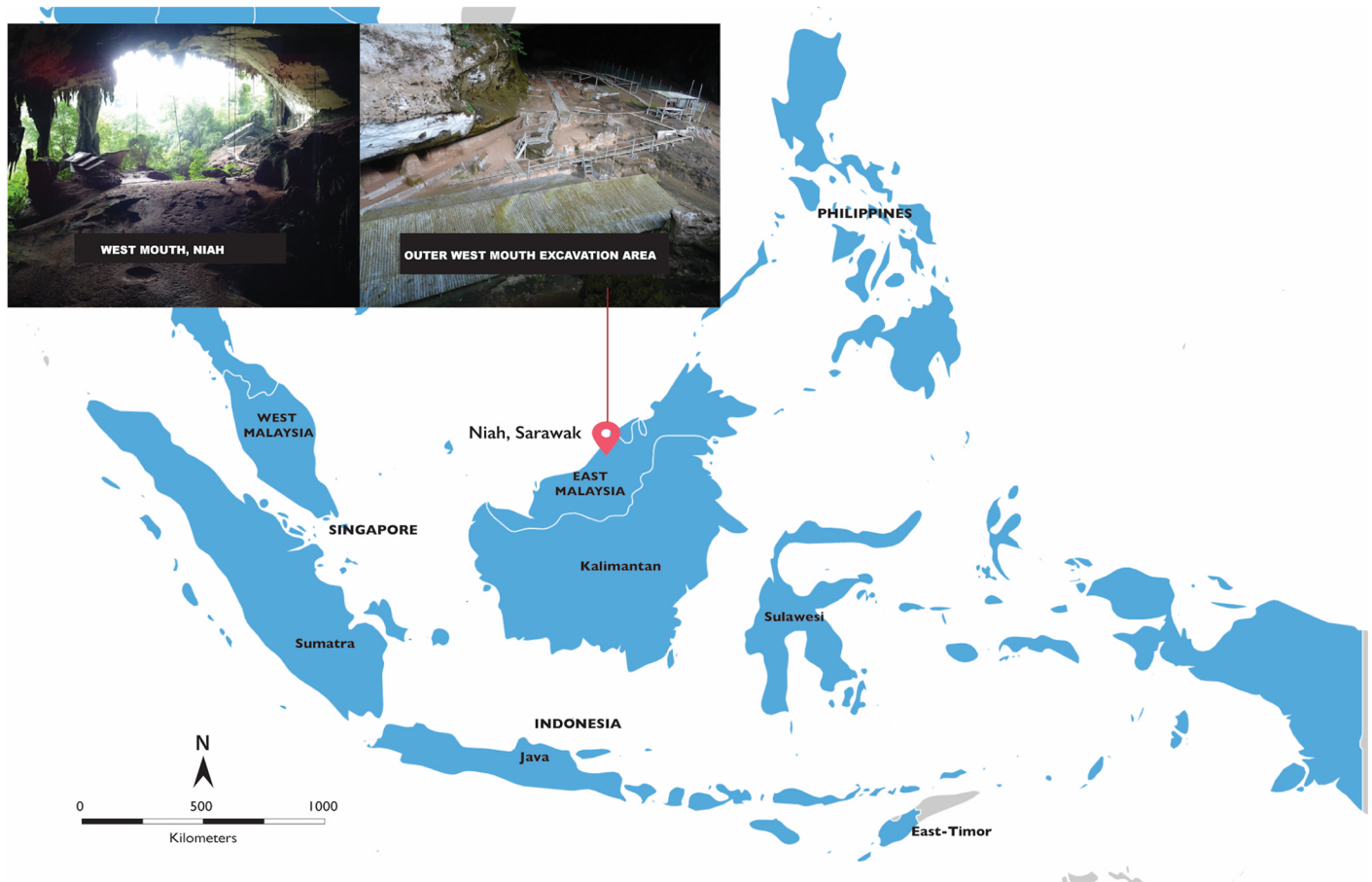
Fig 1. The West Mouth of the Niah Caves and its location within island Southeast Asia (Credits: photographs D. Curnoe; map adobe stock under an extended license).

https://doi.org/10.1371/journal.pone.0196633.g001