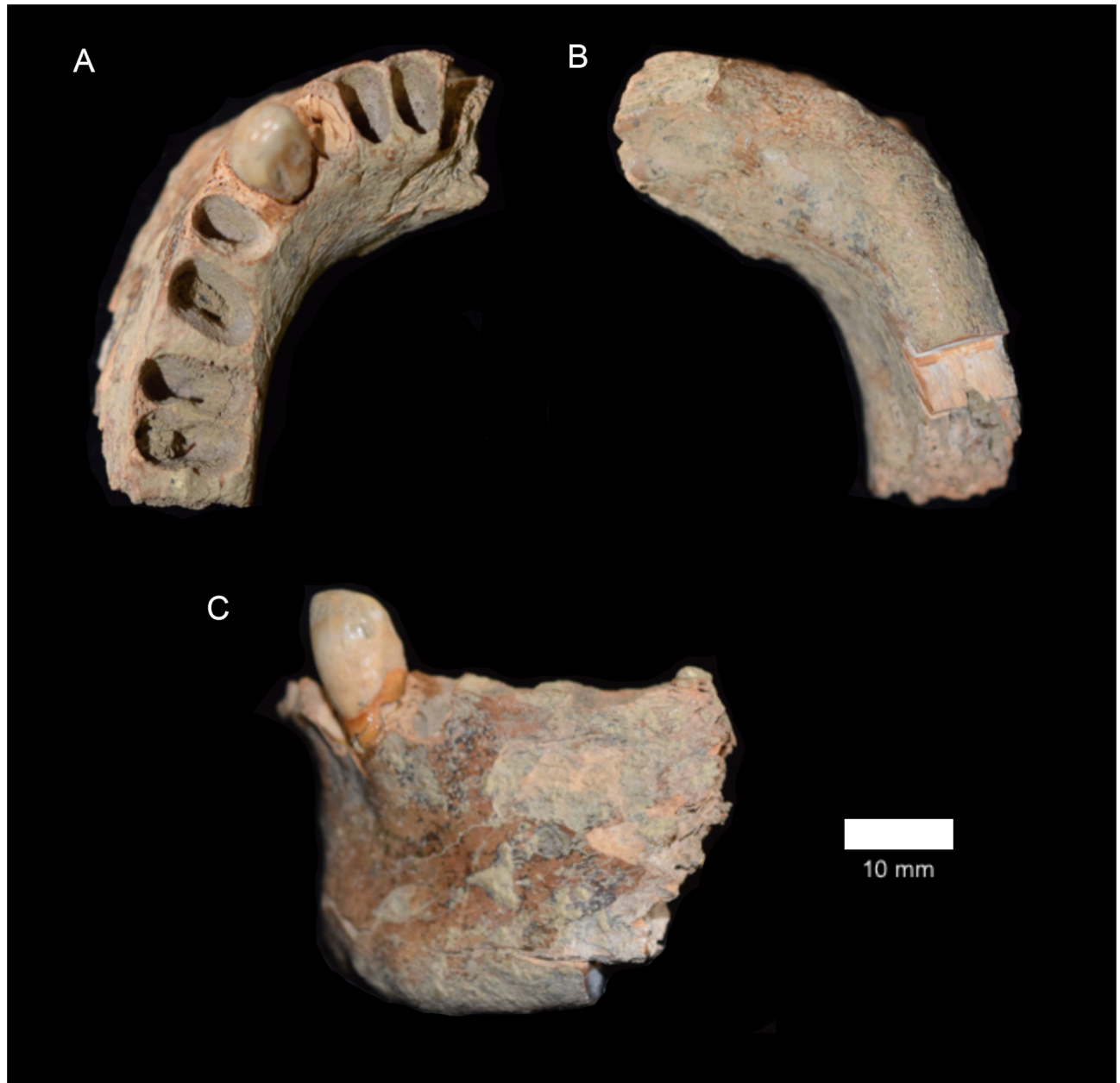
Fig 3. Human mandible D/N5 42–48" from the West Mouth of the Niah Caves. A. Superior view. B. Inferior view. C. Left lateral view.

https://doi.org/10.1371/journal.pone.0196633.g003