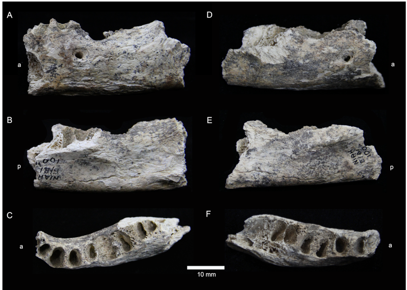
Fig 2. Human mandible E/B1 100" from the West Mouth of the Niah Caves. A. Left fragment, lateral view. B. Left fragment, medial view. C. Left fragment, superior view. D. Right fragment, lateral view. E. Right fragment, medial view. F. Right, superior view. a = anterior, p = posterior.

https://doi.org/10.1371/journal.pone.0196633.g002